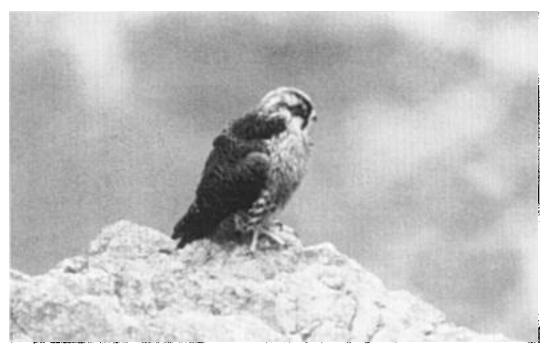
Figure 2. Immature Peregrine Falcon of the tundra subspecies F. p. tundrius, Southeast Farallon Island, 6 November 1987.