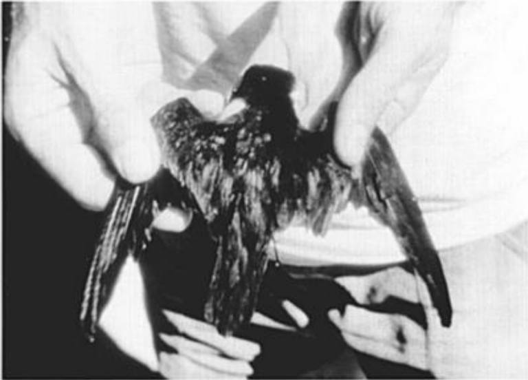
Figure 2. Least Storm-Petrel, Lake Havasu, 26 September 1997.

Black and Least storm-petrels are common in both the northern gulf and along the northern end of Nora's track in the Pacific, making their origin