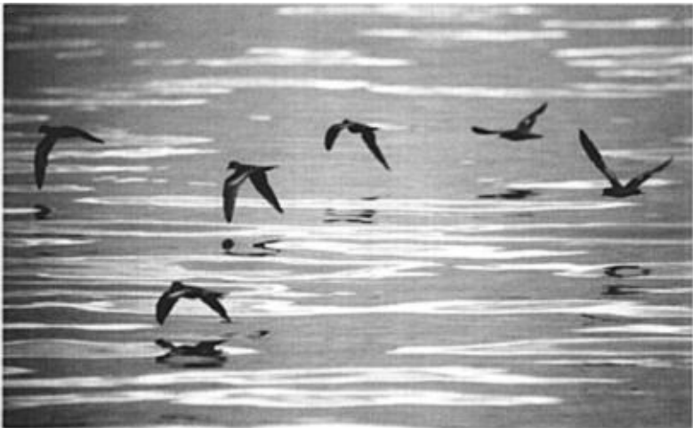
Figure 1. Black Storm-Petrels, Lake Havasu, 26 September 1997.

Approximately 40 Black Storm-Petrels ( Oceanodroma melania ) were seen and photographed at Lake Havasu on 26 and 27 September (Figure 1). Reports were from the mouth of Bill Williams delta, Takeoff Point, Cattail Cove, the north end, and from the California side in San Bernardino Co. (many observers). The last report was of eight birds on 30 September by E. A. Cardiff and Dori Myers. At the south end of the Salton Sea, J. Coatsworth reported three or four birds on 27 September. The number there fluctuated with a high of 17 on 11 October (M. A. Patten). The last report was on 9 November (H. King). There were no previous records for Arizona. Inland records in southern California are from the north end of the Salton Sea, Riverside Co., 21 September 1986 (McCaskie 1987) and King's Canyon National Park, Tulare Co., 5 October 1994 (Yee et al. 1995). Although the