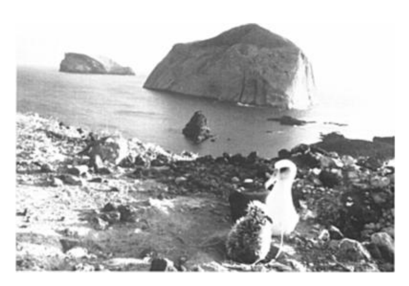
Figure 3. Area 1 of the Laysan Albatross colony, Isla de Guadalupe. Terrace with little cover from the wind (February 1992).