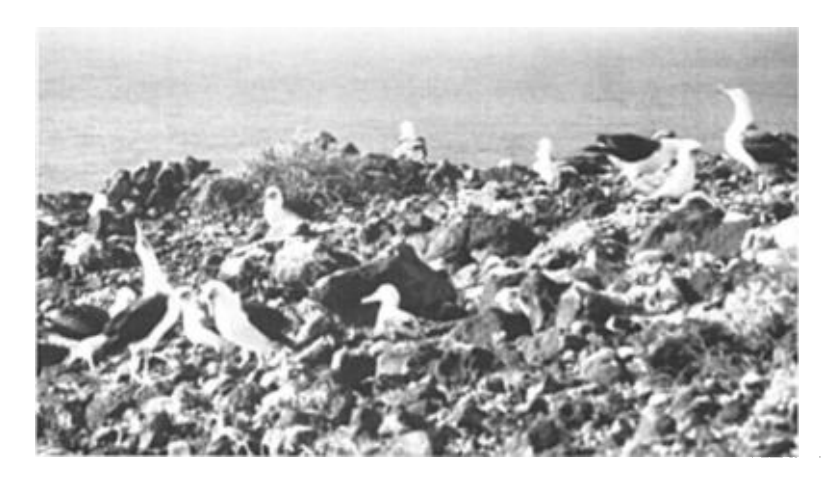
Figure 2. Area 1 of the Laysan Albatross colony, Isla de Gualaupe. Slope sheltered from the wind by rocks and brush (February 1992).