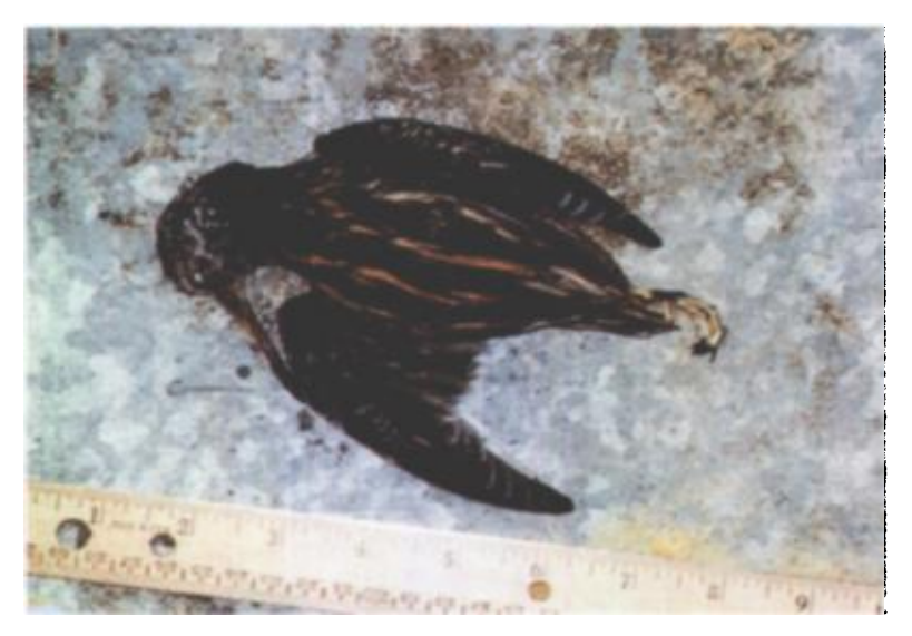
Figure 3. California's second Jack Snipe (213-1990), collected at Colusa National Wildlife Refuge, Colusa Co., 2 December 1990.