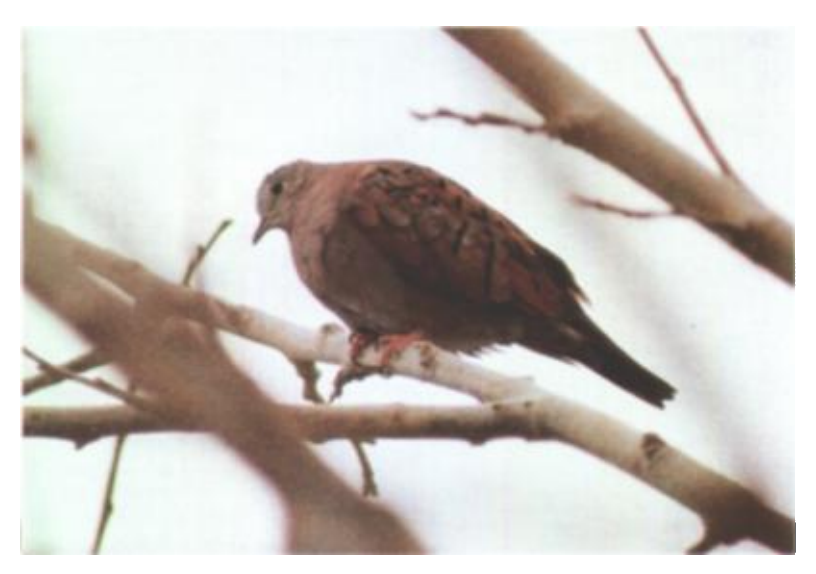
Figure 4. Ruddy Ground-Dove (212-1991), age/sex unknown, at the Bermuda Palms Trailer Park near Earp, San Bernardino Co., 21 December 1991.