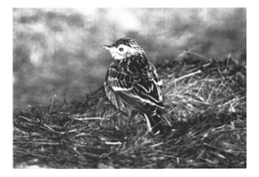
Figure 6. Immature Sprague's Pipit (39-1992) in the Sepulveda Basin, Los Angeles Co., 20 October 1991.

ALDER FLYCATCHER Empidonax alnorum (1). A singing male at the South Fork Kern River Preserve, KER, 11 Jul 1991 (Figure 5; SAL, MW§; 185-1991) provided the first acceptable record for California; this bird may have been present since 9 July. Sonograms prepared from the tape recording matched well published Alder Flycatcher sonograms appearing in Stein (1963), Zink and Fall (1981), and especially Kroodsma (1984), and differed from sonograms of various Willow Flycatcher ( E. traillii ) song types included in those same papers. Given the extreme difficulty in morphological separation of Alder and Willow flycatchers (Stein 1963, Hussell 1990, Seutin 1991), some members expressed reservations about the acceptability of this record. Indeed, the subspecies of the Willow Flycatcher are morphologically more different from one another than the Willow is from the Alder (Browning 1993); nevertheless, the tape-recorded song, typical-looking sonograms, and endorsement of the record by Donald E. Kroodsma led to the addition of this species to the California list.