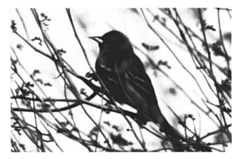
Figure 10. California's fifth Streak-backed Oriole, and the first to have its photograph published, at the Gene Pumping Plant near Parker Dam, San Bernardino Co., December 1991.