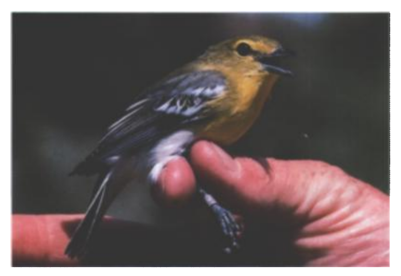
Figure 7. Yellow-throated Vireo (209-1991) netted at Mojave Narrows Regional Park, San Bernardino Co., 22 September 1991.