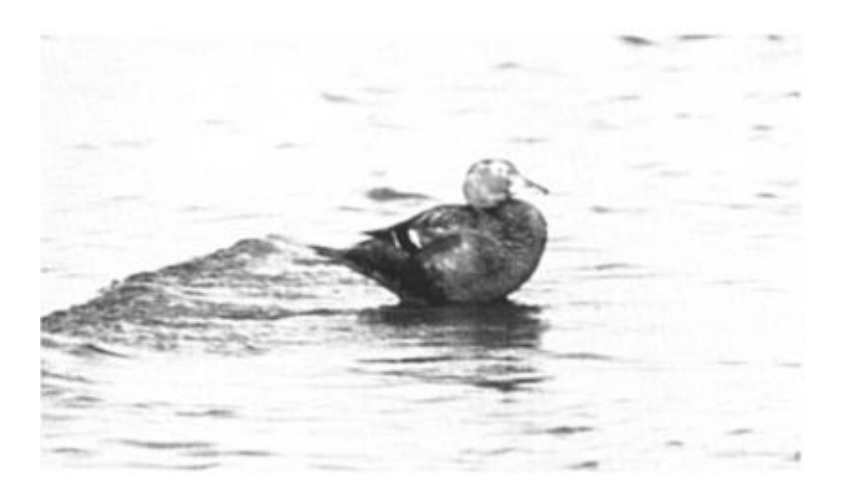
Figure 2. The Steller's Eider (181-1991), apparently an adult female, that wintered at Bodega Bay, Sonoma Co., in 1991/1992. This photograph was taken 21 January 1992.

Age determination of fall Buff-breasted Sandpipers can be difficult, although adults should have worn flight feathers. A whitish belly is a good character for juveniles, but some can show a nearly uniform buff belly and thus resemble an adult (P. Pyle in litt.). The best feature is the scapular and wing covert pattern: these feathers on fresh-plumaged juveniles have brown centers with black subterminal borders and white