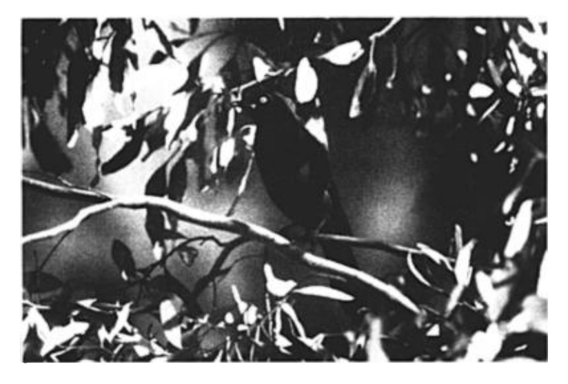
Figure 9. Bronzed Common Grackle (8-1992) at Furnace Creek Ranch, Death Valley National Park, Inyo Co., 17 October 1991.