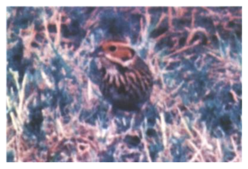
Figure 8. California's first, and North America's fourth, Little Bunting (145-1991), photographed on Pt. Loma, San Diego Co., 23 October 1991.