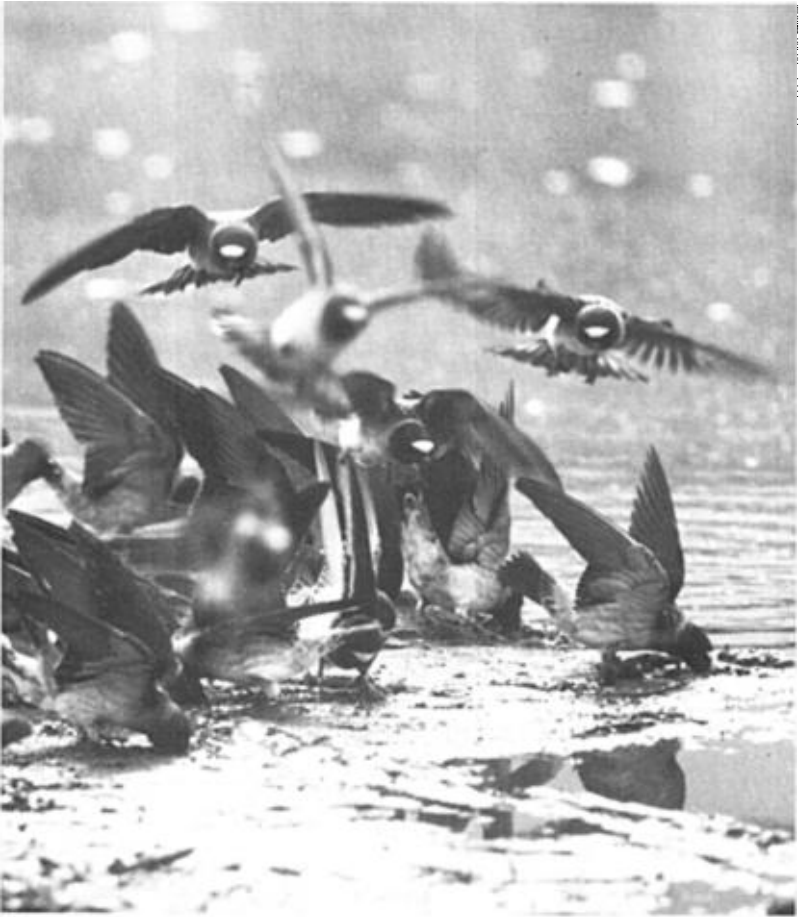
Cliff Swallows collecting mud