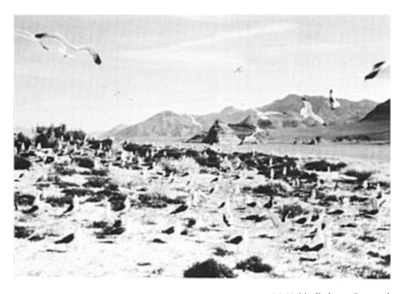
Figure 2. California Gull rookery at Anaho Island National Wildlife Refuge, Pyramid Lake, Nevada, 23 July 1990.

California Gulls had resumed nesting on Anaho Island by 1927, when Gromme (1930) reported seven nests there; by 1940 there were 200 nests