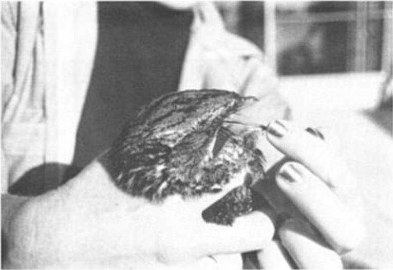
Figure 1. Head of Chuck-will's-widow picked up at Half Moon Bay, San Mateo Co., California. Note lateral filaments on rictal bristles.