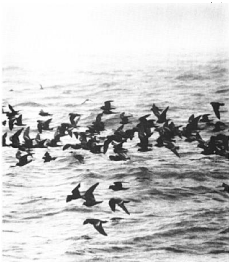
Storm-Petrels, Monterey Bay, September 1974