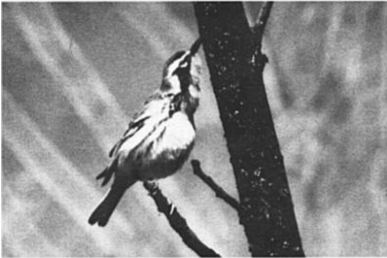
Figure 1. Yellow-throated Warbler ( Dendroica dominica ), Laramie, Albany Co., Wyoming, 25-27 May 1983. The color 35 mm slide from which this print was made shows bright yellow extending from the chin down to and including the upper breast. A complete description is in the text.

The bird was foraging mostly in deciduous trees (Plains Cottonwood, Populus sargentii , and American Elm, Ulmus americanus ) in the bud stage, although it did visit nearby Blue Spruce ( Picea pungens ) trees. Commonly, it gleaned food (presumably insects) from branches and the underside of developing leaves. Between foraging attempts the bird hopped about with occasional short flights to other branches. Observed foraging attempts varied in height from 3 m (10 ft) to 14 m (46 ft). My original notes contain no reference to any vocalizations, nor do I recall any.