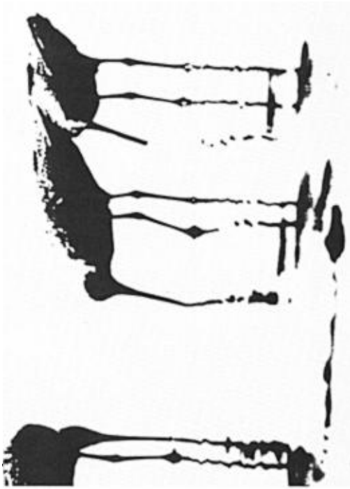
Marbled Godwits ( Limosa fedoa )