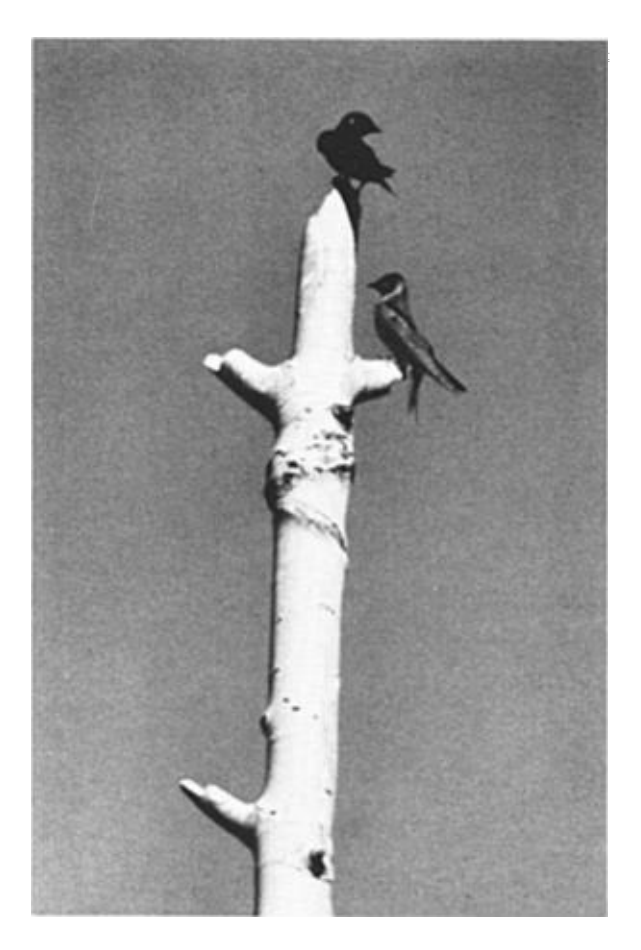
Figure 1. Nesting pair of Purple Martins perched in a Quaking Aspen snag adjacent to the nest tree in southwest Colorado, 18 km northeast of Stoner, July 1978.

In early September 1978, the first martin nest tree was felled along with all remaining trees during a clean-up operation of the harvested area. On 20 and 21 June 1979, a pair of Purple Martins was seen in an open area around a beaver pond 0.75 km from the 1978 nest site. The male martin was observed making unsuccessful attempts to establish a nest in a hole occupied by a Tree Swallow ( Iridoprocne bicolor ). Although an effort was made to locate the martins, they were not seen in the area again that summer and fall. Presumably, the martins left after failing to secure a suitable nest site. The swallows prefer to nest in tree cavities in relatively open areas where they can fly to and from the nest sites. Such areas are limited in old growth aspen stands. Modification of clear-cutting practices to leave cull and dead aspen trees, either scattered or in groups, would provide many suitable nesting sites for Purple Martins and other swallows.