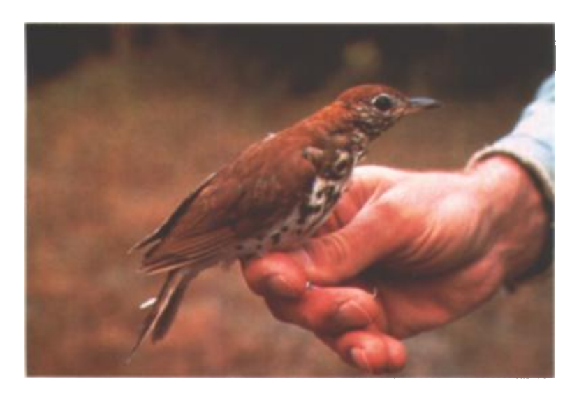
Figure 3. Wood Thrush ( Hylocichla mustelina ) (80-1977), 18 Jun 1977, Palomarin, Marin Co, California.