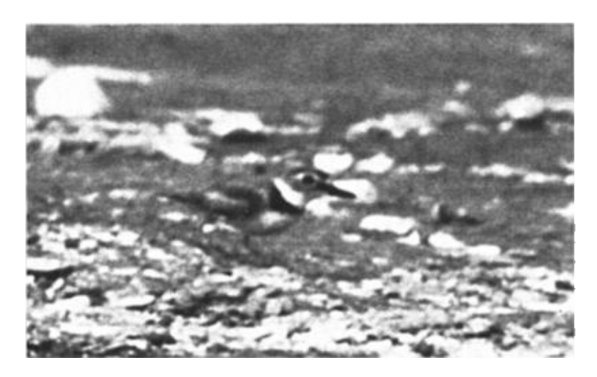
Figure 2. Wilson's Plover ( Charadrius wilsonia ) (74-1977), 28 Jun 1977, McGrath State Beach, Ventura Co., California.