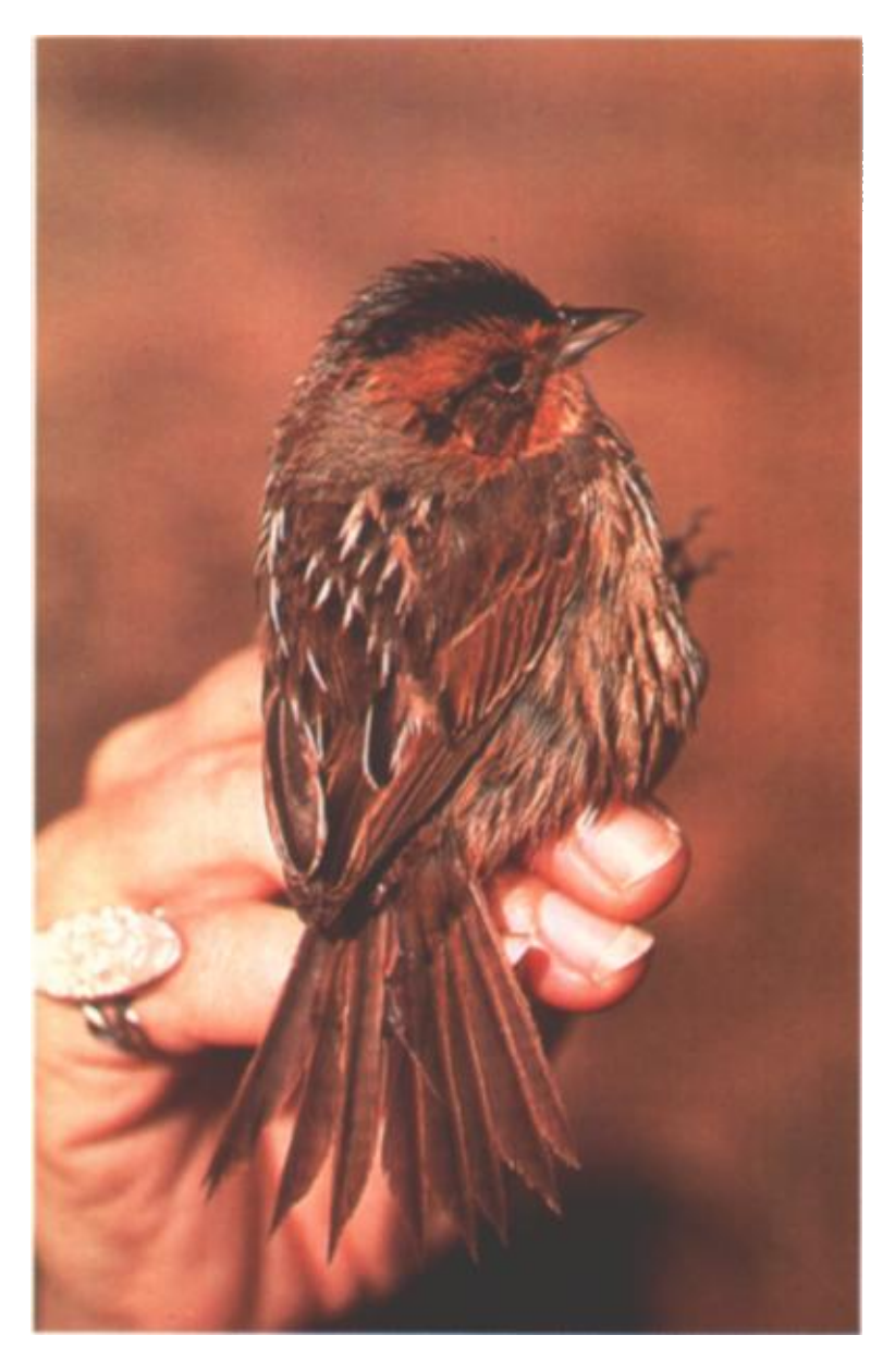
Figure 5. Sharp-tailed Sparrow ( Ammospiza caudacuta ) (14-1977), 6 Feb 1977. Bolinas Lagoon, Marin Co., California.