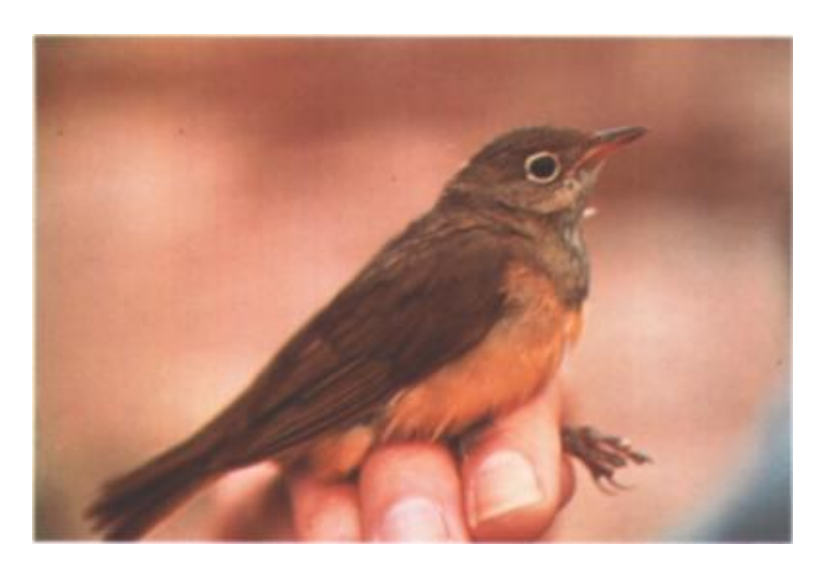
Figure 4. Connecticut Warbler ( Oporornis agilis ) (17-1978), 19 Jun 1976, SE Farallon Island, San Francisco Co., California.