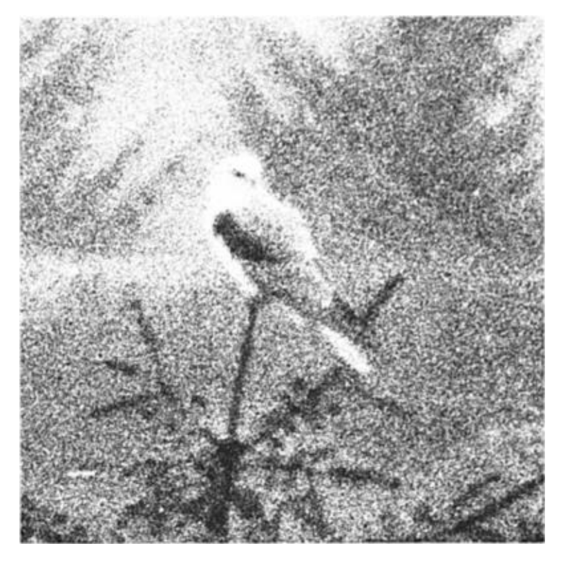
Figure 1. White-tailed Kite ( Elanus leucurus ) 6 km west of Raymond, Pacific Co., Washington, on 23 February 1978.

The range and population size of the White-tailed Kite ( Elanus leucurus ) have been increasing in western North America and Central America since the late 1940s (Eisenmann 1971). This expansion was evident in Oregon in the 1970s, as kites became established residents at several Rogue and Willamette valley locations ( American Birds Regional Editor's files) and the first breeding record for the state was obtained at Finley National Wildlife Refuge, Benton Co., in 1977 (Henny and Annear 1978).