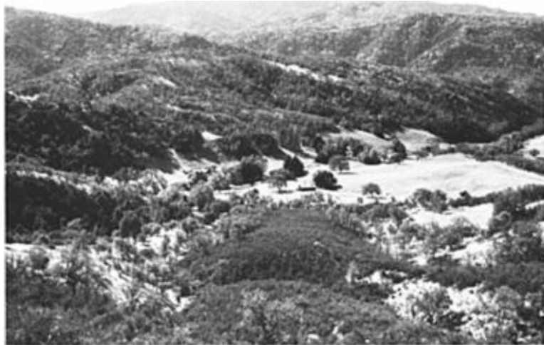
Figure 2. View of Hastings Reservation showing the five major vegetation types.

The Reservation contains five major vegetation types (Figure 2) typical of south coast range foothill vegetation (Griffin 1974). These are: mixed evergreen forest, including Black ( Quercus kelloggii ), Golden ( Q. chrysolepis ), and Coast Live ( Q. agrifolia ) oaks, California Laurel ( Umbellularia californica ), and Madrone ( Arbutus menziesii ), with an understory of Poison Oak ( Rhus diversiloba ), Coffeeberry ( Rhamnus californica ), gooseberry ( Ribes sp.), Cream Bush ( Holodiscus discolor ), and Brake Fern ( Pteridium aquilinum ); foothill woodland, dominated by Blue Oaks ( Q. douglasii ) with Valley Oaks ( Q. lobata ) locally present, especially in oak savannas; riparian woodland of Western Sycamores ( Platanus racemosa ), Coast Live and Valley oaks, willows ( Salix sp.), and Bigleaf Maple ( Acer macrophyllum ) and Red Alder ( Alnus rhombifolia ) locally; chapar-