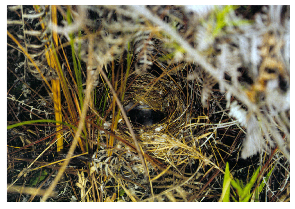
FIG. 3. Photograph of first-reported ground nest built by Pine Warblers in Pinus occidentalis forest in the Sierra de Bahoruco, Dominican Republic, March 1998.

height relative to tree height was 0.82 \pm 0.09 .