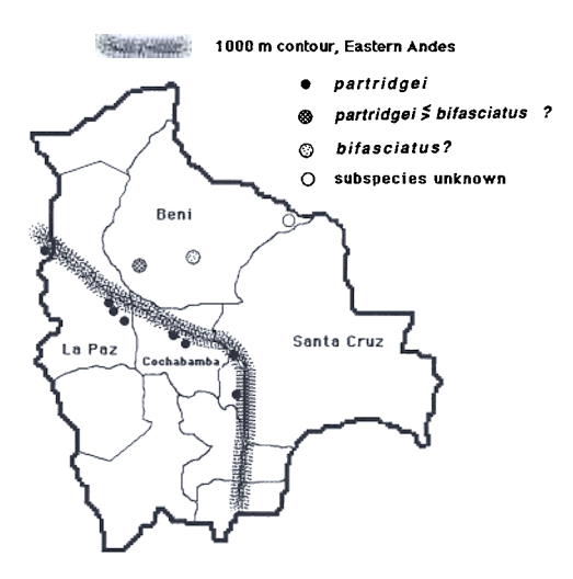
FIG. 2. Distribution of Platyrinchus mystaceus Bolivia.