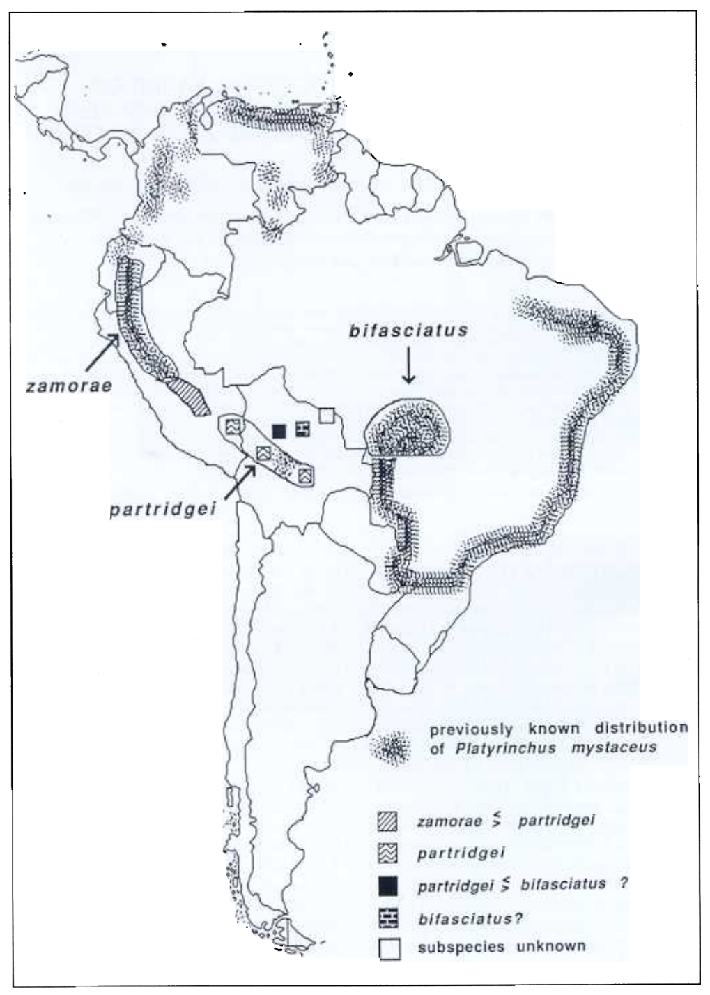
FIG. 1. Distribution of Platyrinchus mystaceus in South America.