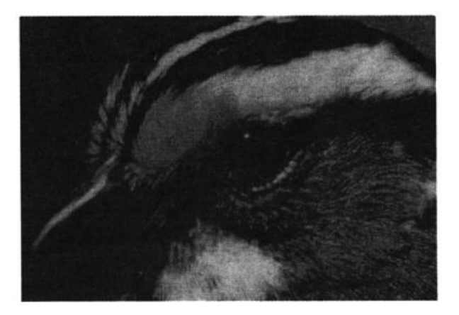
White-throated Sparrow

2000 - Megill Weber - Study of Blackpoll Warblers Rebecca Suomaia - Study of stopover sites of migrant passerines Mark Hauber - How brood parasites learn to recognize their own species for reproductive success