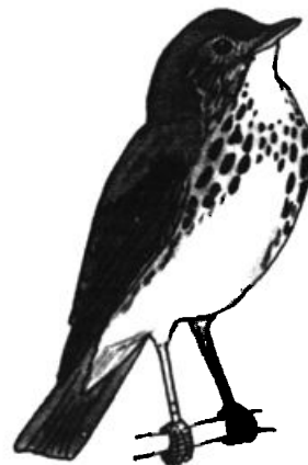
Hermit Thrush

My thanks to the Cherokee National Forest (TN) and the Pisgah National Forest (NC) for permission to band birds at this site.