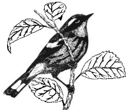
Ruby-crowned Kinglet, Tennessee Warbler, Magnolia Warbler by George West