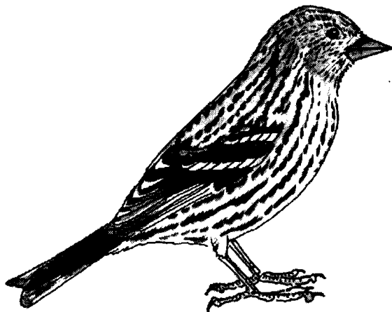
Pine Siskin