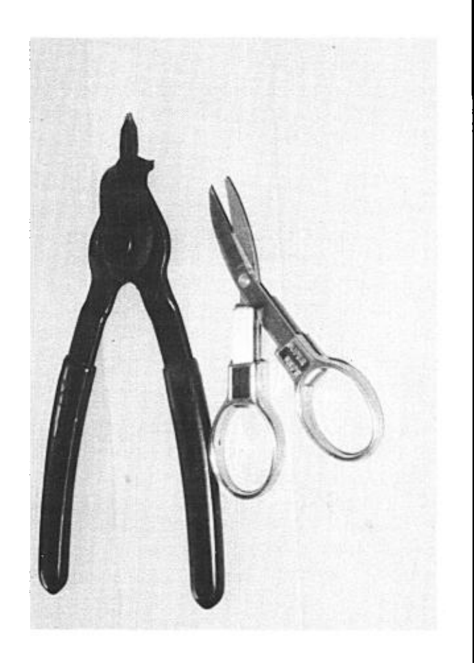
Figure 2. Small scissors used to open a size zero band on a Dark-eyed Junco ( Junco hyemalis ).

Figure 1. Retaining ring pliers (left) and small scissors.