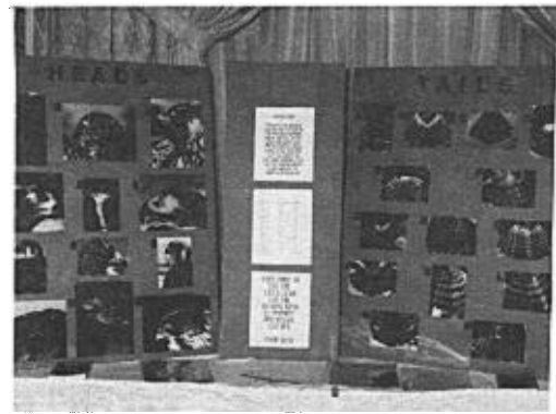
Raptor Quiz ( Heads and Tails )