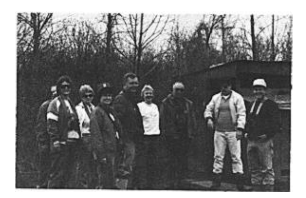
A group of EBBA members at a Braddock Bay hawk blind.

Plan now to attend this year's Annual EBBA meeting in Delaware (see previous page for details).