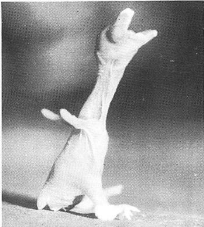
Figure 1. A six-day-old Red-headed Woodpecker ( Melanerpes erythrocephalus ) in the begging posture in response to "turning out the lights." The heavily calloused "heels" and the tail support the bird; the out-stretched wings help it keep its balance. (From Jackson 1970.)