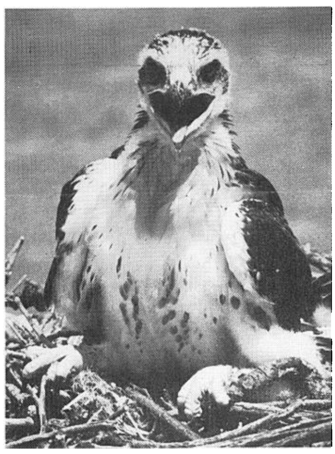
Figure 2. Nestling Ferruginous Hawk just after banding.

Figure 3. Recoveries of Ferruginous Hawks banded as nestlings in northeastern Colorado, 1973-76. Solid lines indicate direct recoveries. Dashed lines indicate indirect recoveries. Age in years is shown at point of indirect recovery. Recoveries of a 4.6-year and a 1.5-month old occurred 5 km and 21 km respectively from the banding/nest site and are not shown.