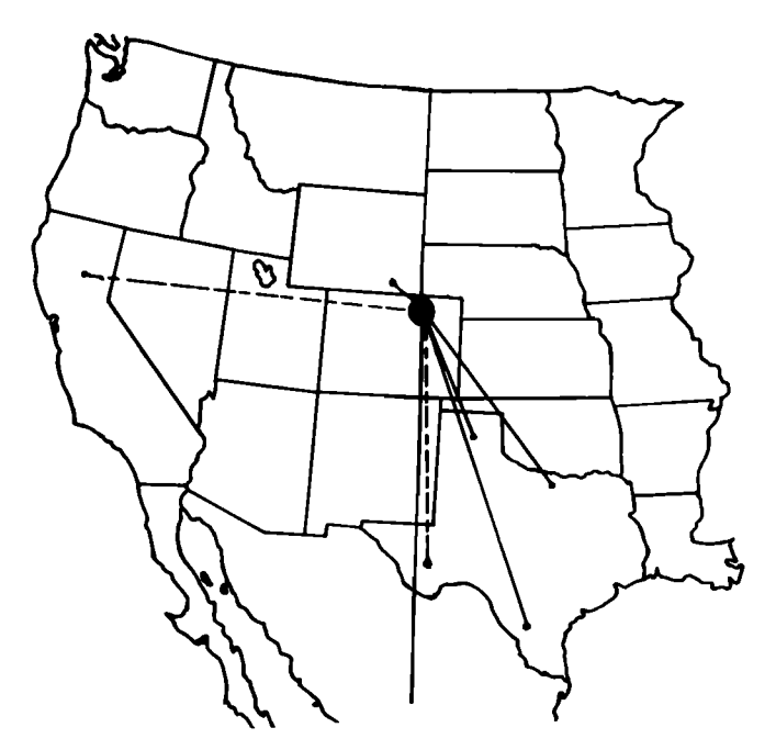
Figure 3. Recoveries of Ferruginous Hawks banded as nestlings in northeastern Colorado, 1973-76. Solid lines indicate direct recoveries. Dashed lines indicate indirect recoveries. Age in years is shown at point of indirect recovery. Recoveries of a 4.6-year and a 1.5-month old occurred 5 km and 21 km respectively from the banding/nest site and are not shown.

Figure 1. The breeding range of the Ferruginous Hawk and location of the banding area in relation to coal producing regions of the western United States.