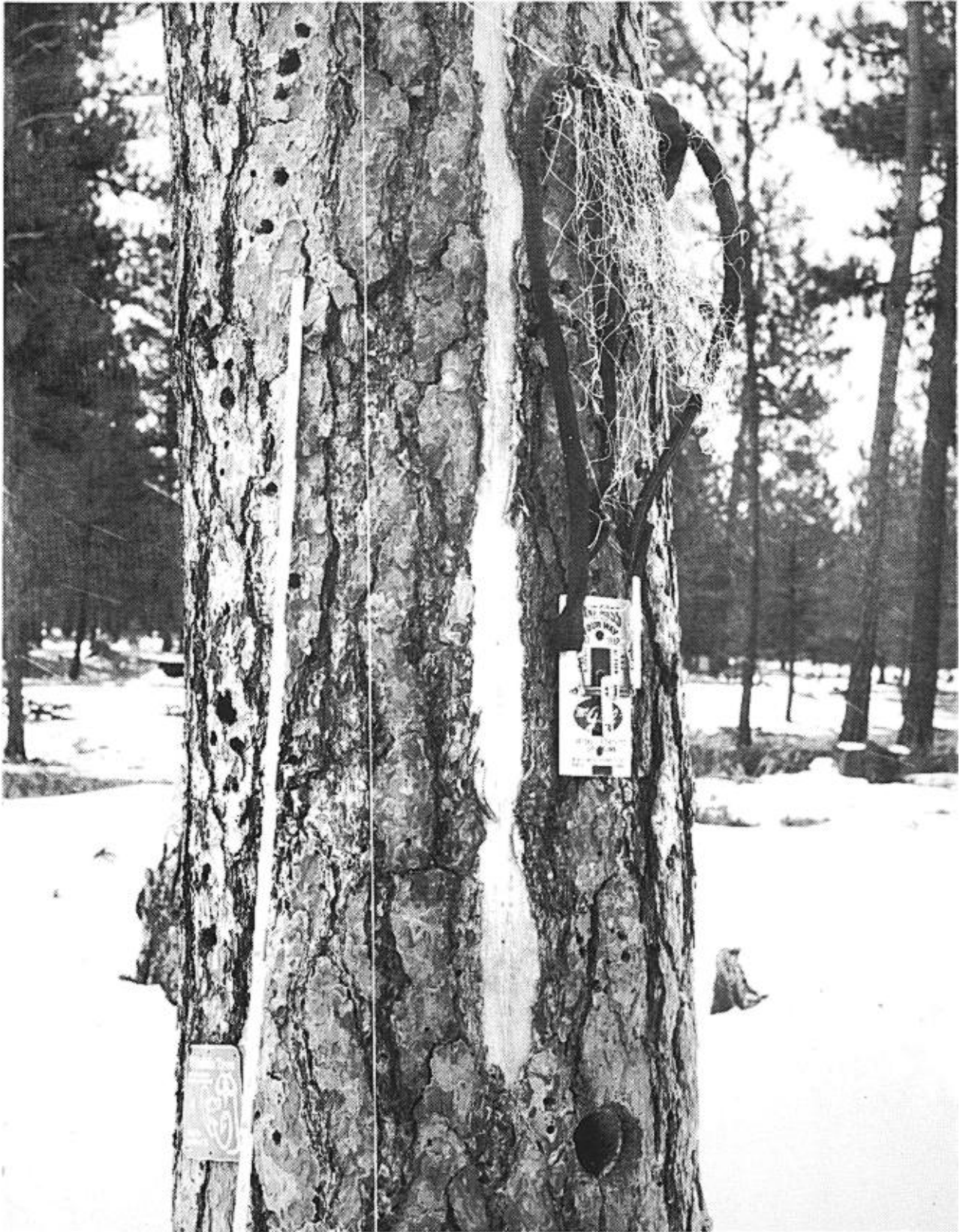
Figure 3. The net trap set and ready to be released.