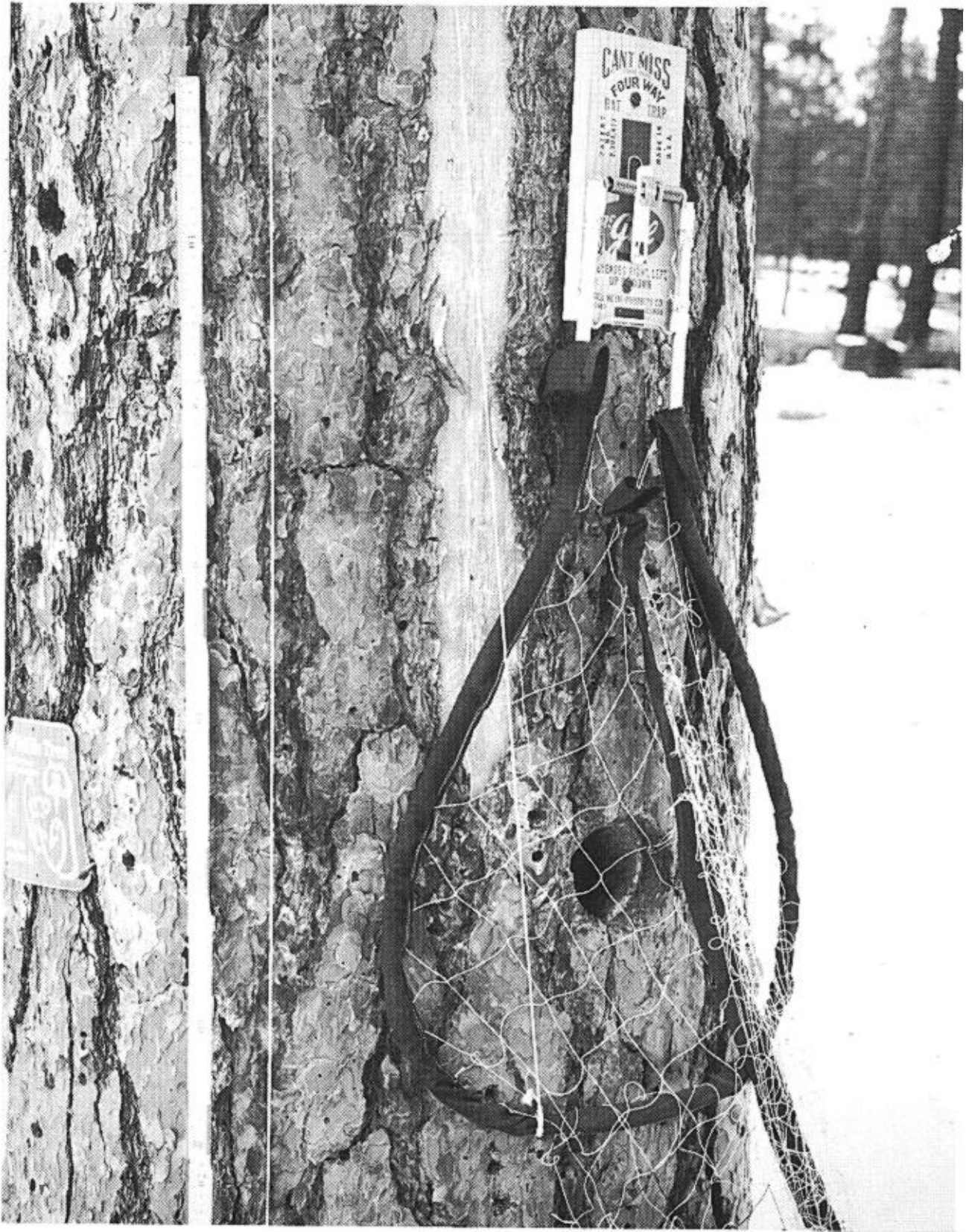
Figure 2. The net trap after being released.