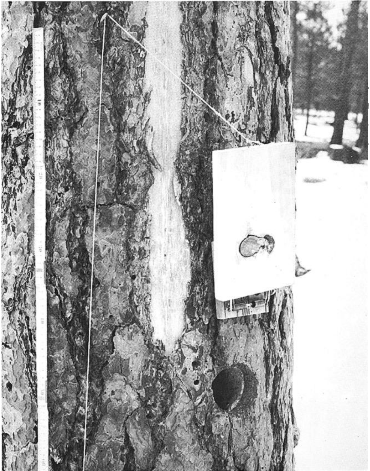
Figure 1. The board trap set and ready to be released.