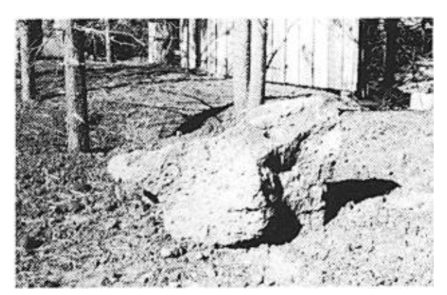
Figure 1. The rock containing the nest hole

527 Myron Street, Schenectady, NY 12309 This paper was presented at the 1977 E.B.B.A. Conference.