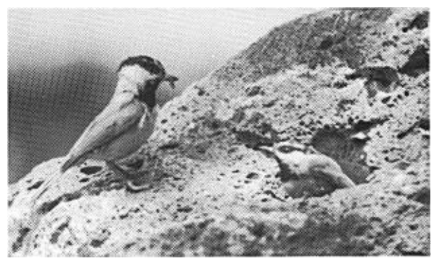
Figure 2. Adult bird bringing food to the nest

or a determination of the final outcome of this nesting attempt.