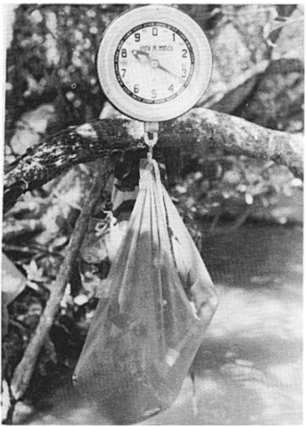
Fig. 3. Weighing banded nestling with 10-kilogram scales.

As I finish with each nestling, I place it — facing away from me — under the corduroy cloth with the others and slip the hood off. When I am finished with all nestlings, I climb down from the nest as far as possible but still within reach of one corner of the cloth, which I then pull down slowly. By the time the nestlings stand up, I am well away from the nest and often out of the tree.