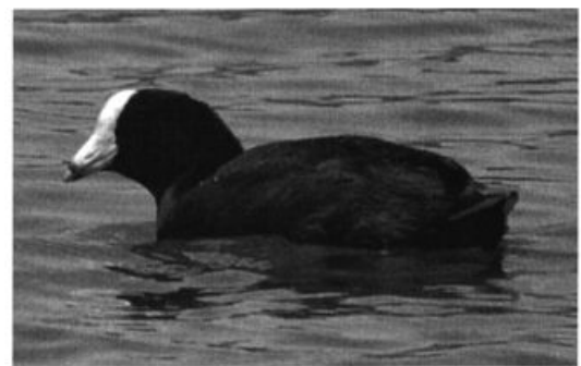
Up to 15 Caribbean Coots, a local high count, were noted 7 June 2007 at Laguna Puerto Diablo, Vieques Island, Puerto Rico.