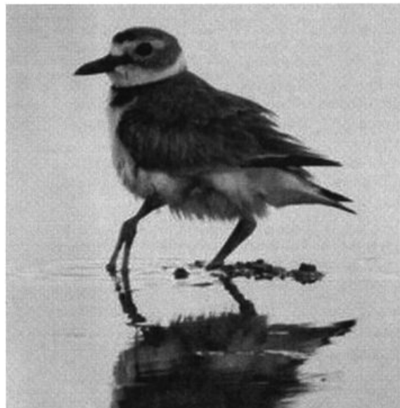
Confirming local nesting, this Wilson's Plover brooding a chick was caught on film 10 June 2007 at Boca Quebrada, Vieques Island, Puerto Rico.

Three Black-bellied Whistling-Ducks at Blue Water Cay, New Providence 24 Jun provided