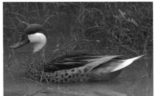
White-cheeked Pintails are fairly common on Vieques Island, Puerto Rico, and are rather tame here, and on Culebra Island, as hunting them is now prohibited. A pair (9 June 2007) took up residence in an ephemeral pond near Blue Beach; they allowed very close approach by cars and people.