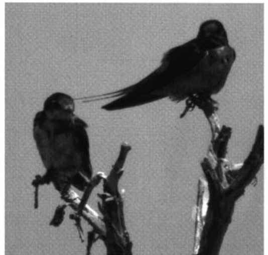
The first summer record for Guadeloupe of Barn Swallow was established by this pair at Petite-Terre Nature Reserve 3 July 2007.

In Bermuda, 2 Laughing Gulls were present throughout Jul, and one Great Black-backed Gull summered (PW). On Cat I., 49 Gull-billed Terns were at a saline pond near Arthur's Town 21 Jun and 50+ at McKinney Pond 22 Jun (CW, PM). A surprising 6 Caspian Terns were found among a flock of Royal Terns at Windemere, Eleuthera 7-12 Jul (EJ).