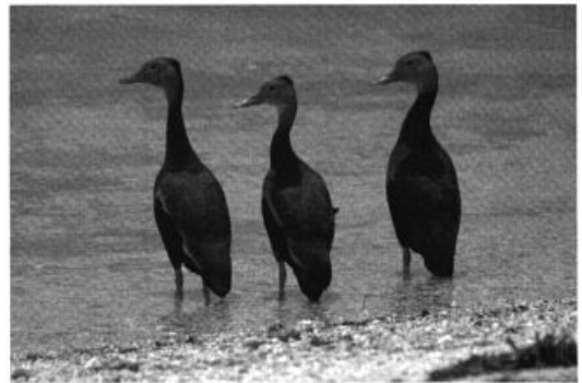
These three Black-bellied Whistling-Ducks, constituting the third Bahamas record, were at Blue Water Cay, New Providence 24 June 2007.