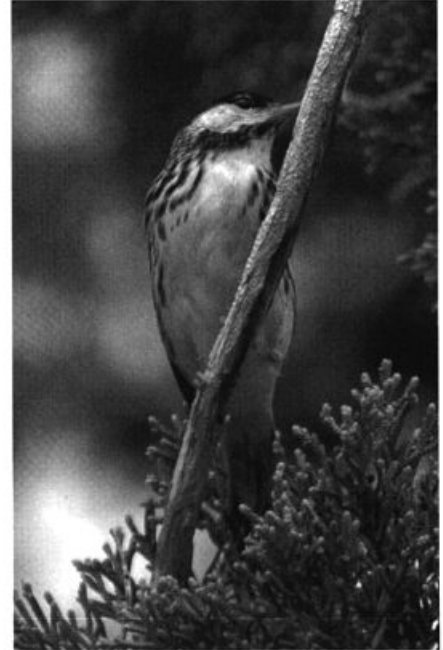
Representing the first summer record of the species for Bermuda, this Blackpoll Warbler was photographed 7 June 2007 at St. Georges.