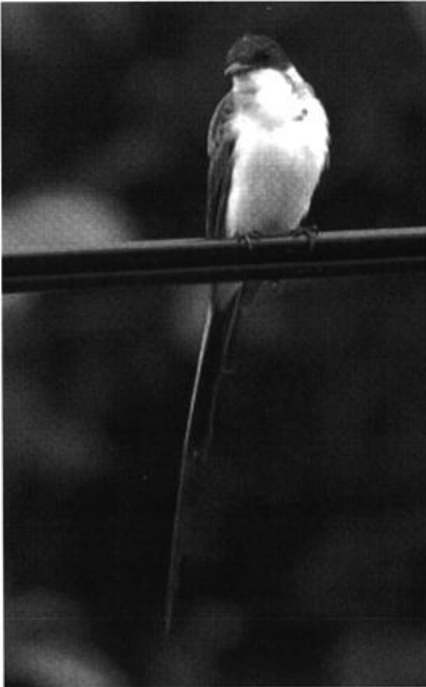
This Fork-tailed Flycatcher provided the first record for Puerto Rico and the eastern Greater Antilles on 8 June 2007, near Green Beach, Vieques Island.

OD, MB). The Bermuda population of Common Terns devastated by Hurricane Fabian (2003) was hit again by Hurricane Florence (2006). Nevertheless, their breeding success improved. A population of 18 birds (eight pairs, plus 2 single birds) resulted in four pairs producing 11 fledglings (DBW). A Plain Pigeon at El Yunque rainforest 11 Jun (BMo) was unusual but not unprecedented. Two White-winged Doves were noted at Pointe des Châteaux, Guadeloupe 14 Jul (AL). A Yellow-billed Cuckoo was seen and one heard in the pine forest of Grand Bahama 30 Jun (WH); another was heard calling at the old fruit farm, Abaco I. 3 Jul (EB), suggesting that this species breeds in the Bahamas. One was an unseasonable find at Spanish Pt., Bermuda 8 Jul (JFI), and 2 were at Laguna Cartagena N.W.R., Puerto Rico 25 Jul (S.C.S.C.B.). The Bahamas' and Exuma's 3rd Short-eared Owl was seen on Sandy Cay, the southernmost cay in the Exuma Chain, 21 Jun (WH). Three endangered Puerto Rican Nightjars were heard and one well seen at Guanica S.F. 25 Jul (S.C.S.C.B.). Late calling Chuck-will's-widows are suggestive of breeding. Sixteen were heard on Grand Bahama 1-2 Jul by WH, one at Coral Harbour, New Providence 2 Jul by CW, and 3 at Treasure Cay, Abaco I. 10 Jul by EB.