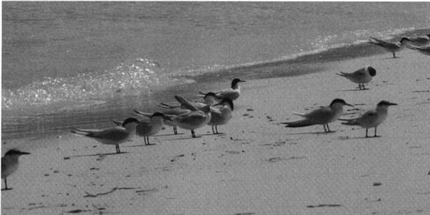
These terns were part of a flock of thirty that caused some confusion before being identified as Roseate Terns, a regular breeder in the Turks and Caicos Islands. These terns were roosting on Water Cay, Caicos Islands 23 July 2007. The West Indian nesters of this species look quite different from northern birds, showing shorter tails and orange bases to the bills.