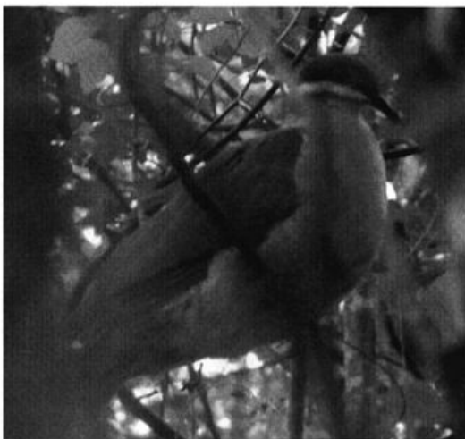
The first photographic documentation for Key West Quail-Dove for Vieques Island, Puerto Rico was established 5 June 2007 at Puerto Mosquito; the photographer had previously documented two other Geotrygon here, Ruddy and Bridled, making it the only location in the world where these three species of quail-dove coexist in close proximity.

were seen in a one-hour birding tour around Inagua N.P. 3 Jul (LG, AB, KB, TR). A single Neotropic Cormorant 11 Jul at Windemere, Eleuthera was away from its normal locations on the island (EJ). Summering heron species in Bermuda included 10 Great Blue Herons, a Great Egret, and a Little Blue Heron (DBW); the long-staying Gray Heron was also present