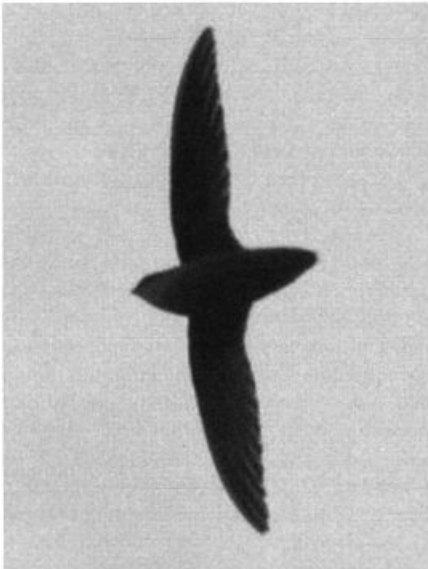
Four Chimney Swifts were observed feeding with Cliff Swallows over San Elijo Lagoon, San Diego County, on 3 June 2007.

(MLS); the species is previously unrecorded in the county at this time of year. Two Ancient Murrelets, casual as far s. as San Luis Obispo in summer, were at San Simeon 2-3 Jun (AFS), 2 were near there 16 Jun (DP), 2 more were at Guadalupe Beach, Santa Barbara 7 Jun (BKS), and 2 were farther s. at Pt. Dume 23 Jun (KLG). Rhinoceros Auklets were more numerous than normal in San Luis Obispo , and one was as far s. as La Jolla 27 Jul (PEL). Of greater interest was the presence of Horned Puffins, undoubtedly associated with the influx of these birds to cen. California, with as many as 14 found along the coast of San Luis Obispo (TME, NG, AFS, GPS, MLS), one at V.A.F.B. 5 Jun (WTF), 2 in flight off Leo Carrillo State Beach 9 Jun (MSanM), another in flight past Point Vicente 30 Jun (KGL), and one alive at North Island Naval Air Station 31 Jul (MM; *SDNHM).