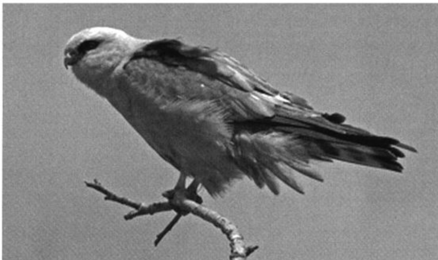
This first-summer Mississippi Kite remained for only a short time in the Tijuana River Valley near Imperial Beach, San Diego County, on 8 July 2007 before leaving this perch, gaining altitude, and disappearing from view to the south.

an ad. and one fledgling were seen there 11 Jun (JSF). The only Little Blue Heron away from coastal San Diego was an ad. at S.C.R.E. 11 Jul (BA). A Tricolored Heron at S.E.S.S. 14 Jul (GMcC) was probably the same bird seen in this area in May and Jun. At least 4 Reddish Egrets were present on the coast of San Diego and Orange during the summer; one around Santa Barbara 7 Jul–10 Aug (BA) provided the 3rd record for Santa Barbara. The continuing pair of Yellow-crowned Night-Herons in Imperial Beach, San Diego fledged 3 young in early Aug (GMcC), and the ad. paired with a Black-crowned Night-Heron at North Island Naval Air Station, San Diego was still attending a hybrid nestling 3 Jul (MM). Two second-year Roseate Spoonbills at S.E.S.S. 19–26 Jun (EM, GMcC) were believed to be 2 of the 3 in this area during the winter, but 3 hatch-year birds there 26 Jul+ (GMcC) were new arrivals. The first of the few (maximum 9 at the end of Jul) Wood Storks at the S.E.S.S. this summer was seen 1 Jun (GMcC).