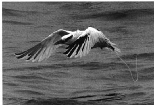
This adult Red-billed Tropicbird photographed far to the south-southwest of San Miguel Island, California on 21 July 2007 was in an area where small numbers probably occur annually.

S.J.W.A. (San Jacinto Wildlife Area, including Mystic L., sw. Riverside); V.A.F.B. (Vandenberg A.F.B., nw. Santa Barbara); V.C.G.P. (Ventura County Game Preserve near Pt. Mugu Naval Air Station, Ventura). Museum collections abbreviated in the text are: LACM (Natural History Museum of Los Angeles County) and SDNHM (San Diego Natural History Museum). Because most rarities in s. California are seen by multiple observers, only the observer(s) initially finding and/or identifying the bird are included. Documentation for species on the California Bird Records Committee (C.B.R.C.) review list (see <www.wfo-