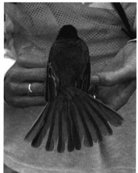
Very few Brown-crested Flycatchers have been found on the coast of Southern California, so this one caught and banded on Point Loma, San Diego County on 24 June 2007 was unexpected. The fact that dark brown on the outer web of the rectrices crosses the feather shaft onto the inner web, and that the rufous on the inner web extends to the tips of the feathers, leaves no doubt as to which of the larger Myiarchus was caught.

A Townsend's Solitaire at V.A.F.B. 29 Jun (MB) established only the 2nd summer record for Santa Barbara . A Hermit Thrush on the summit of Big Pine Mt., Santa Barbara 15 Jun was one of the few to summer in the San Rafael Mts. (PAG); unseasonable lowland birds were in Pacific Palisades, Los Angeles 12 Jun (RB) and near Jawbone Canyon, Kern 27 Jun (DMcN). Miles from breeding habitat, a Wrentit in Marina del Rey, Los Angeles 22 Jun (TMcG) was the 2nd in this general area in