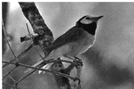
This male Hooded Warbler photographed in the Cuyamaca Mountains of San Diego County on 30 June 2007 was one of three territorial birds found in the Southern California region this summer.