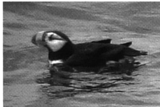
This Horned Puffin at Point Arguello on Vandenberg Air Force Base, Santa Barbara County, on 5 June 2007 was one of at least 19 found along the southern California coast this summer.

At least 15 Common Murres, unexpected in extreme s. California waters in summer were seen along the Los Angeles coast in Jun