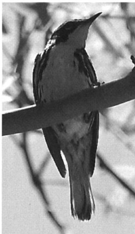
This singing Yellow-throated Warbler, a lost spring vagrant, at Lake Jennings northeast of El Cajon, San Diego County, was photographed on the first day of its 7-8 July 2007 stay.

Sepulveda Basin in Encino, Los Angeles 18 Jun–18 Jul was joined by a female 27 Jun (remaining through 26 Jul); a nest was constructed in a patch of Giant Reed ( Arundo donax ), but apparently no young were produced (BED). Chestnut-sided Warblers were at F.C.R. 6 Jun (LEP) and in La Jolla Canyon, Ventura 19 Jun (AS). A count of 311 Yellow Warblers in the vicinity of S.F.K.R.P. 7 Jul showed the species to be at its highest numbers there since the early 1900s (BB). A Magnolia Warbler was on San Clemente I. 5 Jun (JuW). A Yellow-rumped Warbler at F.C.R. 9 Jun was very late for the desert lowlands (C&RH). Early fall Hermit Warblers were in the Laguna Mts., San Diego 25 Jul (PGi) and at Ridgecrest, Kern 28 Jul (JS). A very late vagrant Yellow-throated Warbler was at L. Jennings, San Diego 7-8 Jul (MBS). A Blackpoll Warbler was at C.L. 8 Jun (SLS). Four straggling Black-and-white Warblers were along the coast 2-26 Jun, along with 4 American Redstarts during Jun; another redstart was at California City, Kern 16 Jun (TEW, LLA). An Ovenbird was in Los Angeles 18 Jun (DS); another at Mt. Palomar, San Diego 13 Jun (PU) was present for the 3rd year at this locality. Three singing MacGillivray's Warblers were on Mt. Palomar 13 Jun (PU); there is only one previous summer record for San Diego. Mid-