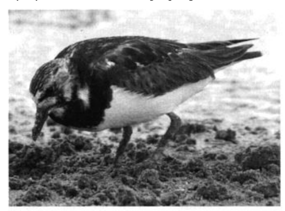
This Ruddy Turnstone, a species casual in Arizona, was present at Willcox 22 (here 30) July through 1 August 2007.