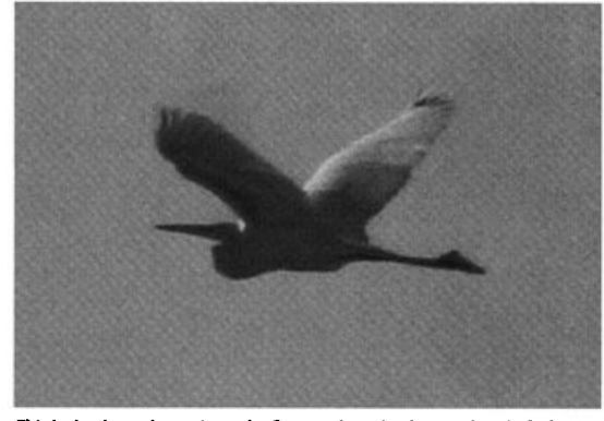
This lucky shot substantiates the first northern (and Arctic Coast) Alaska record of Great Egret, seen near Barrow on 16 June 2007.

The end of the shorebird passage reached into Jun, highlighted mostly by Bering Sea vagrants, including a Terek Sandpiper reported at St. Paul I. 4 Jun (Field Guides) and another at Buldir I. 8-10 Jun (SL, SS, EA, CS) and a Far Eastern Curlew at Buldir I. 31 May (ph. SL, EA, SS, CS). A Red Phalarope was most un-