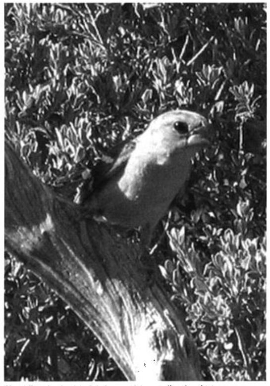
This Yellow Grosbeak in Ash Canyon, Arizona 1 (here) and 2 June 2007 was, amazingly, in the same yard frequented by an Aztec Thrush in 2006!

Thirty or more Band-tailed Pigeons were at atypically low elevations in Portal 16-25 Jun and in nearby lower Cave Cr. into Jul (EH). Interrupting the recent explosion of sightings, just 2 Ruddy Ground-Doves were reported, at Cascabel 12 Jul (MA) and s. of Amado 26 Jul (MB). Whiskered Screech-Owls are known from the New Mexico portions of the Peloncillo Mts. but not so from the Arizona side,