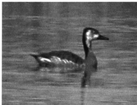
This aberrant Fulvous Whistling-Duck was at Lordsburg, Hidalgo County, New Mexico on 29 July 2007. There are fewer than a dozen acceptable records, all from the April-May and July-October periods.

Among 12 Snowy Plovers at Laguna Grande 18 Jun were 2 chicks plus 3 ads. on nests (DE-B). Mountain Plovers among the bison and prairie dogs on the Vermejo Ranch e. of Cimarron included an ad. with chicks 2 Jun (ph. DC), another ad. with chicks 19 Jun (ph. DC), and a nest with eggs 4 Jul (ph. DC); small numbers were reported w. to Taos 16 Jun (JP), Santa Fe 8 Jun (JPB), Sandoval 18 Jun (LS), and Cibola 4 Jun (DK). Early were single Solitary Sandpipers near Gila 6 Jul (JP)