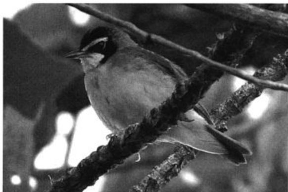
This Kentucky Warbler was far west at Farmington, San Juan County, New Mexico 5-13 (here 11) June 2007.