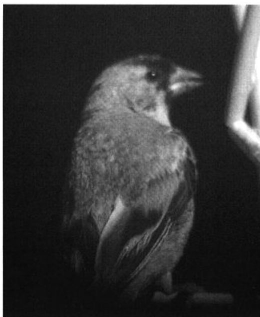
Part of an unusual summer dispersal of the species through much of the West, this male Lawrence's Goldfinch visited a feeder in the Datil Mountains, Catron County, New Mexico, from 19 July (here) into August 2007.