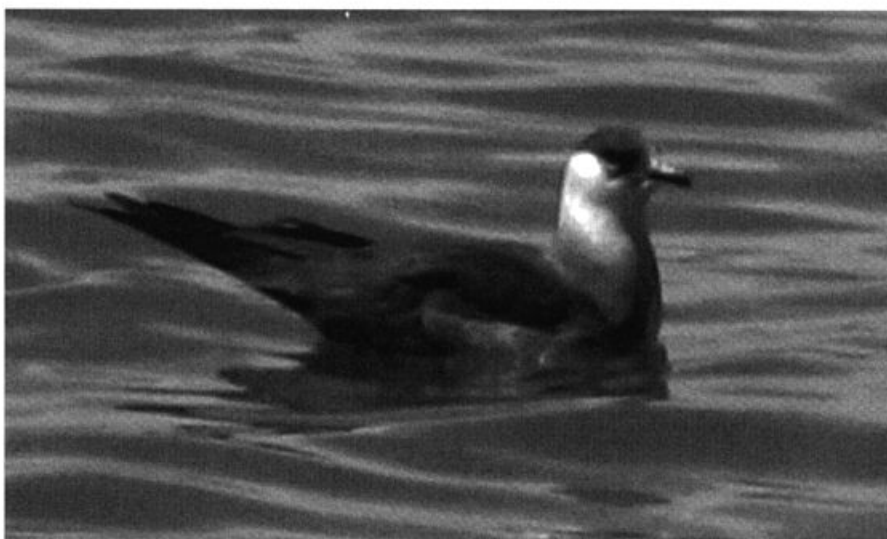
This adult Parasitic Jaeger at Brantley Lake, Eddy County 21 June 2007 furnished New Mexico's second confirmed record of the species.