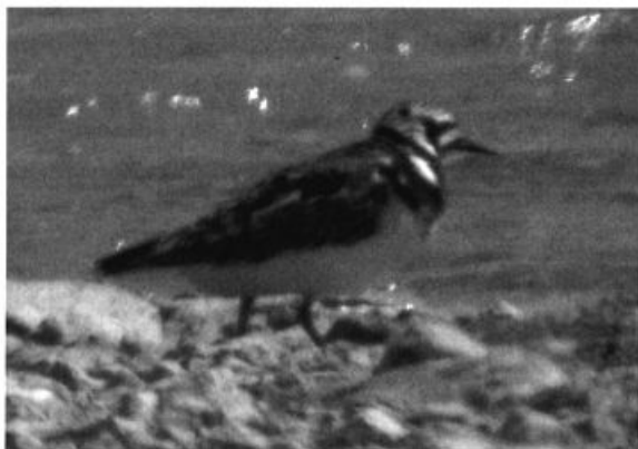
A Ruddy Turnstone at Brantley Lake, Eddy County, New Mexico 8 June 2007 was a surprise, as the species is rare in spring and previously unreported in the state in June.