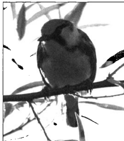
Although not known to nest in New Mexico, Chestnut-sided Warbler has been found in June in four of the past eight years. This male was singing at Corrales, Sandoval County 5 through 24 (here) June 2007.