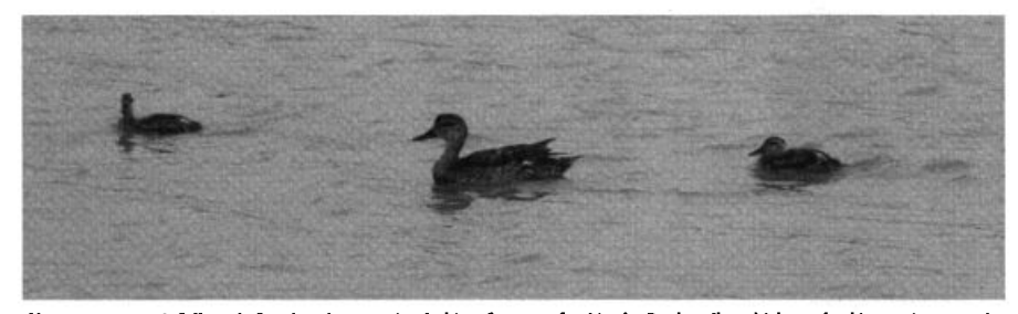
Above-average rainfall made for abundant nesting habitat for waterfowl in the Panhandle, which resulted in nesting records of several species of ducks that are generally considered rare breeders in Texas. This female Gadwall with a total of nine ducklings (here 13 July 2007) represents only about the tenth documented breeding record of the species in the state. Other successful nesting attempts by this species were noted during the period.

A pair of Black-bellied Whistling-Ducks with 7-8 ducklings in Bell 27 Jul (RPi) provided the first evidence of breeding for the county Summer geese included 4 Snows and 4 Ross's at Cactus Playa, Moore 24 Jun (BP) and a summering Cackling Goose at Arthur Storey Park in Houston, Harris (ph. JKe). Two Gadwall broods near Tulia, Swisher 13 Jul and three broods present at the same location 27 Jul (ph. BJ) were notable, as there are only about 10 nesting records for the state. A brood of 9 Northern Shovelers on a playa e. of Happy, Swisher (BJ) represented a very rare nesting record. Lingering Northern Pintails were seen near Angleton, Brazoria 8 Jun (CFr) and at Anahuac N.W.R., Chambers 7 Jul (DVe). A female Northern Pintail with several ducklings found at a pond in Kleberg 30 Jun (LJ) represents what may be the first breeding record for the Coastal Bend. Single drake Canvasbacks were seen at Tornillo Res., El Paso 4 Jun (BZ) and Fort Hancock Res., Hudspeth 15 Jun (JPa). Ring-necked Ducks rarely summer, so a male present all period at the Presidio, Presidio (ML) and another at Nelson