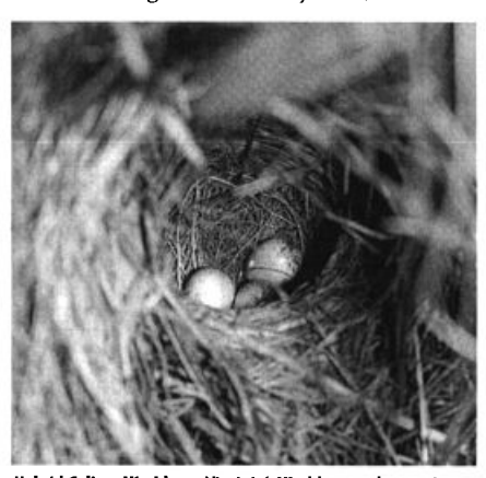
Hybrid Colima Warbler × Virginia's Warblers are known in the upper elevations of the Davis Mountains of far western Texas. This nest, the first known for this combination, was found 13 June 2007 in a secluded canyon in closed-canopy Ponderosa Pine—Silverleaf Oak woodland.