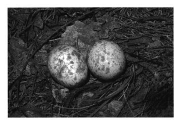
Chuck-will's-widows have been known to occur in Donley County in the eastern Panhandle of Texas for quite some time, but it was only in 2007 that nesting was finally documented. This nest (here 28 April) was located in the spring, and the young successfully fledged in the early summer.