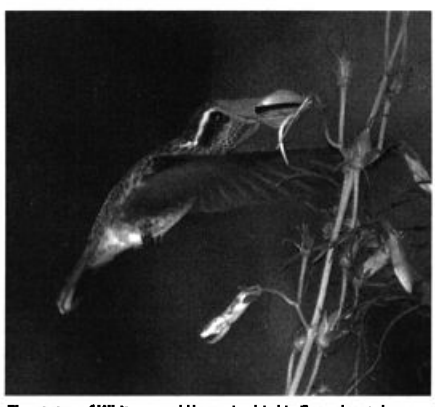
The status of White-eared Hummingbird in Texas has taken an interesting turn in the past three years. Summer 2007 saw another "invasion" of sorts into the Trans-Pecos and raised speculation that this movement could be part of a normal (or developing) post-breeding dispersal. This hatch-year bird (here 5 July) was one of at least six present in the Davis Mountains during the period.