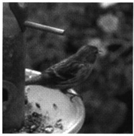
Nothing short of bizarre, this Common Redpoll on the Bolivar Peninsula, Galveston County, Texas on 13 June 2007 provided the third summer record for the state. Astonishingly, all of these records have come from coastal locations.

Rd., Waller during the period (BH); this species is a very rare summer resident on the U.T.C., though it is usually present in good numbers in adjacent Washington. Similarly, Indigo Buntings were present all period in Waller, with a peak of 10 singing birds 15 Jul (BH); this species is more common in savanna habitats in Washington. Six ad. and 2 fledgling Indigo Buntings provided continued evidence of breeding at White River L., Crosby 30 Jun (AH). A territorial male Varied Bunting was in the Carrizo Mts. in extreme e. Hudspeth 22 Jul (ph. JPa). There are few county records, but the species is likely more widespread in the area than is known due to a lack of access to appropriate habitat. Dickcissels had an incredible breeding season on the South Plains, with reports of multiple birds