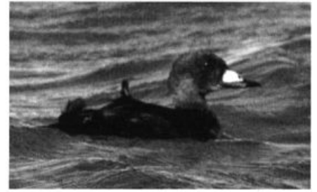
Accidental in the Northern Great Plains in summer, this Black Scoter was at Audubon National Wildlife Refuge, North Dakota 10 July 2007 (here) through the end of the period.

(DOL). Sandhill Cranes nested successfully at two locations in McHenry , ND. One pair was at J. Clark Salyer N.W.R., where the last con-