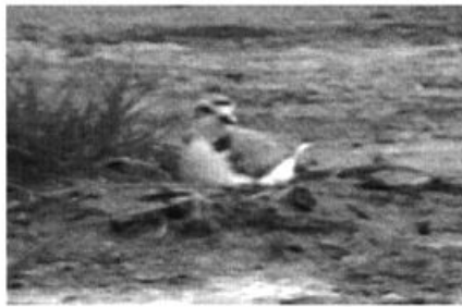
Part of the Snowy Plover invasion into the Dakotas this summer, this individual was one of several at Stone Lake, Sully County, South Dakota 16 June 2007.

An incredible 71 Ferruginous Hawks were seen in a mile-long stretch of road n. of Chester, MT 11 Jul (HM). A male Peregrine Falcon hatched in Fargo, ND in 2005 spent the summer on a water tower in Grand Forks but did not succeed in attracting a mate