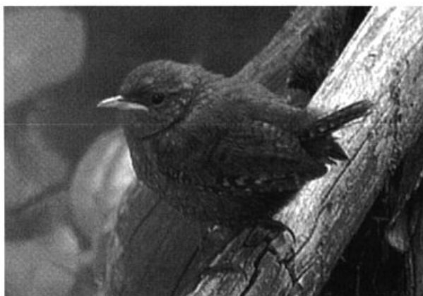
This fledgling Winter Wren in the Black Hills 30 June 2007 provided the long-expected first breeding confirmation for South Dakota.

A first confirmed nesting for South Dakota, fledgling Winter Wrens were photographed 30 Jun in Lawrence (MR). An Eastern Bluebird at Freezeout L. 21 Jun was well w. of the species' usual range in Montana (MS). Sprague's Pipits made an appearance back in some of their former range, with 10 individuals noted 18-27 Jul in McPherson and Faulk , SD (RR, BU, MM). A Chestnut-sided Warbler was in Custer , SD 22 Jun (BH). The species has nested in the Black Hills. Representing the 12th and 13th reports for North Dakota, Prothonotary Warblers were at Audubon N.W.R. 2 Jun (JL) and in Emmons 17 Jun (DNS). The Prairie Warbler reported in the spring in Lincoln , SD remained through at least 14 Jul. Also in Lincoln , SD, 3 Kentucky Warblers were heard 9 Jun (RDO), and at least one remained through 14 Jul; the species is casual in this state. A Wilson's Warbler 24 Jul in Custer provided the 2nd summer record for South Dakota (MM).