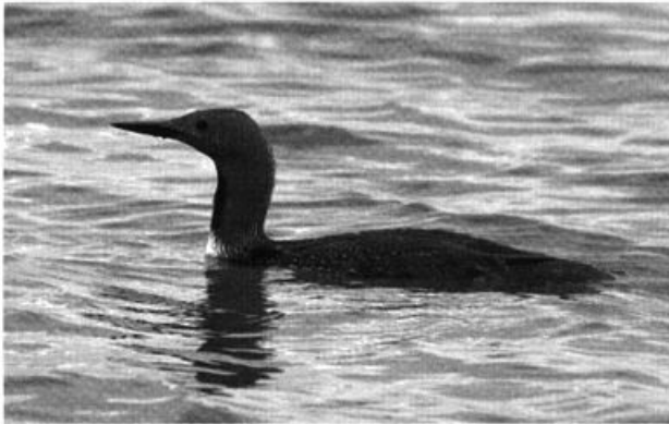
This Red-throated Loon at Rafferty Dam, Saskatchewan on 25 June 2007 was both very rare and out of season.