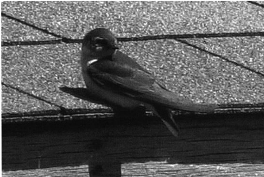
East of its normal breeding range, this Violet-green Swallow, seen here 27 June 2007, fledged one young at Swift Current, Saskatchewan.