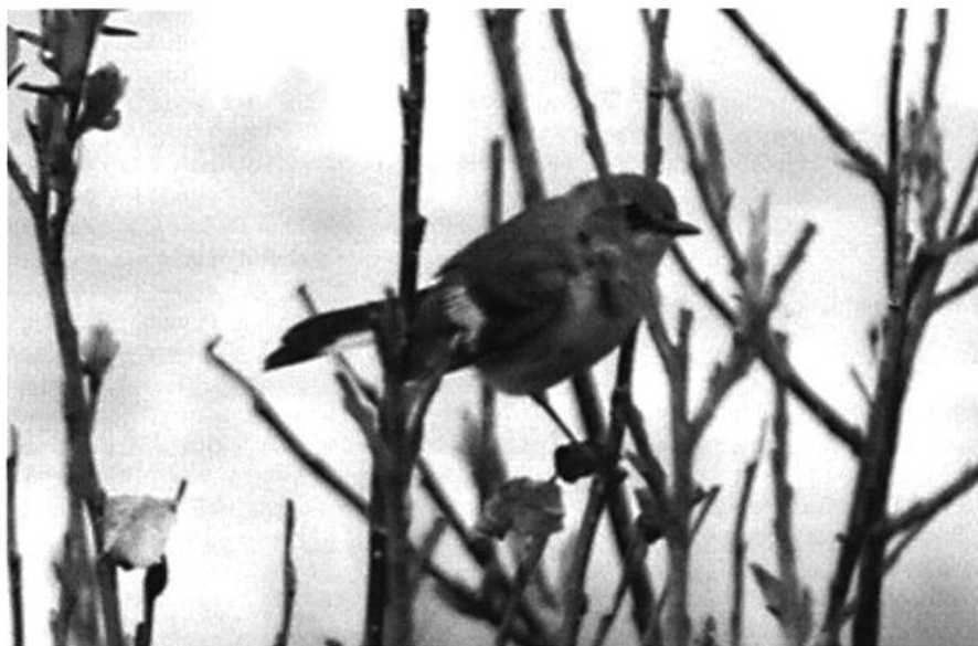
This immature male American Redstart near Churchill, Manitoba on 14 and (here) 15 June 2007 provided the fourth record for the area.

cent Manitoba range were single Sprague's Pipits at Cloverdale 20 Jun (RK) and Oak Hammock Marsh 24 Jun (SG).