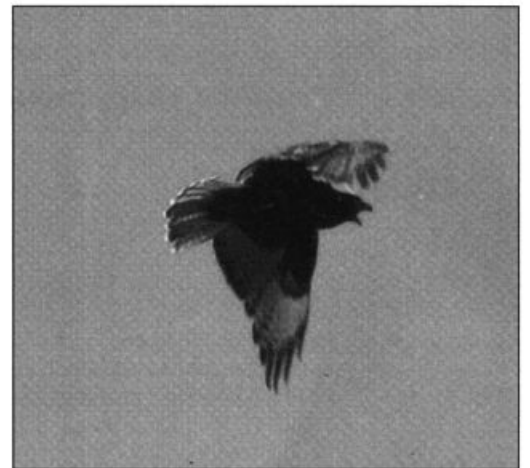
This Red-tailed Hawk near its nest in Calgary on 14 July 2007 may have provided the first known case of a dark-morph bird breeding in the south of Alberta.

Mid-Jul saw the start of a good Red-breasted Nuthatch flight in s. Manitoba. For the 2nd year in a row, a Northern Wheatear was noted near Churchill, 7 Jun (EN). A nesting pair of Eastern Bluebirds at Ponton, MB 27 Jun was far north (PT). Out of range were a Wood Thrush at Deep L., SK 16 Jun (TH), a Varied Thrush at Churchill 11 Jun (C.N.S.C.), and lone Northern Mockingbirds at Regina, SK 5 Jun (SW, m.ob.) and Arrowwood, AB 19 Jun ( fide TK). East of their re-