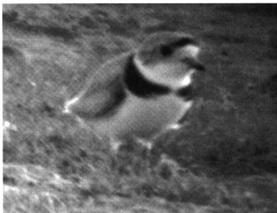
Nunavut's first Piping Plover was a startling find at Akimiski Island in southern James Bay 3-10 (here 9) June 2007.