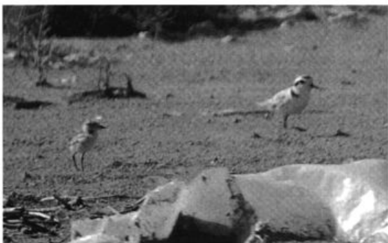
Representing only the fourth documented breeding record for the state, this Snowy Plover chick accompanied by the male parent was one of two family groups encountered at Rutherford Beach, Cameron Parish, Louisiana on 6 June 2007.

early and represented one of few Jun records for the state.