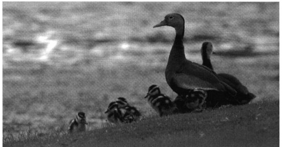
Although just a stone's throw from the Audubon Park Zoo, this family of Black-bellied Whistling-Ducks at Audubon Park in New Orleans, Louisiana in late June 2007 (date unknown) was considered wild and part of the ongoing range expansion in the Southeast.

Numbers (combined ads. and young) of breeding or presumed breeding waders at Grassy L. 22 Jun included 2 Least Bitterns, 13 Snowy Egrets, 40 Little Blue Herons, 6 Tricolored Herons (5 ads., one young, two nests with eggs; first documented breeding at this site), an astounding 10,500 Cattle Egrets, 24 Green Herons, 16 Black-crowned Night-Herons, and 320 White Ibis (DS et al.). Along with the human population, Yellow-crowned Night-Herons are rebounding in suburban New Orleans, where 46 ads. and young were associated with a colony of 31 active nests located 17 Jun in surviving live oaks in a previously Katrina -flooded neighborhood (DPM) A Plegadis ibis near Sorrento 12 Jun, 6 there