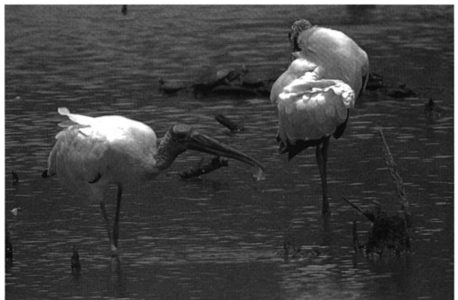
Up to 14 Wood Storks visited a small pond in Muscle Shoals, Colbert County, Alabama in late June 2007 (here with small fish on 29 June). The species is only an occasional visitor to the Tennessee Valley region of northern Alabama.