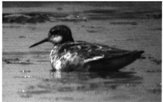
This male Red-necked Phalarope in Union County, Kentucky 20 June 2007 had an injured leg. It represents a first June record for the state.

Territorial Savannah Sparrows were reported from Fayette , KY 1 Jun (BPa, SV) and ne. Shelby , KY 10 Jun (BSm). Four pairs were at three sites in Washington , TN through the season (RK); a Savannah Sparrow in Greene , TN 29 Jun-5 Jul (DMi) also suggested breeding. A new colony of at least 10 singing Henslow's Sparrows was reported just e. of Touristville , Wayne , KY in early Jul (ph. CO); 3 territorial birds were in Marshall , TN 3 Jun+ (DMO). The White-throated Sparrow that lingered at Richmond , Madison , KY into late May was last seen 1 Jun (THg). One in Putnam , TN 8-20