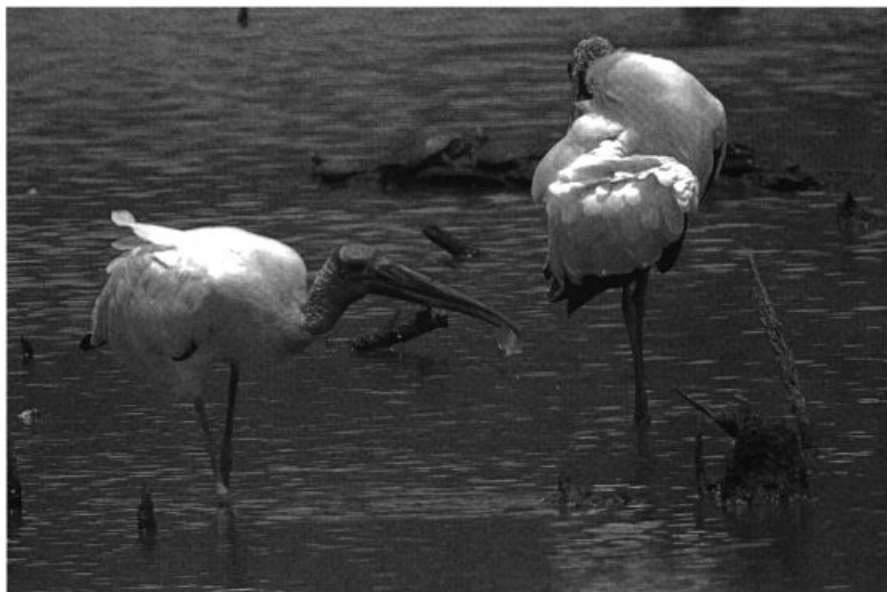
Up to 14 Wood Storks visited a small pond in Muscle Shoals, Colbert County, Alabama in late June 2007 (here with small fish on 29 June). The species is only an occasional visitor to the Tennessee Valley region of northern Alabama.

(J&MP). Summering American White Pelicans are rarely found inland in Alabama, making the 24 in Hale, AL 15 Jul quite noteworthy (GJH). The long-staying individual at the mouth of Town Cr., Colbert/Lawrence, AL continued for a 3rd year (m.ob.). Three Neotropic Cormorants (2 ads., one imm.) at Dutch Brake, Sunflower 15 Jul were rare for Mississippi (SJD). Repeated observations of Anhinga throughout the season in e.-cen