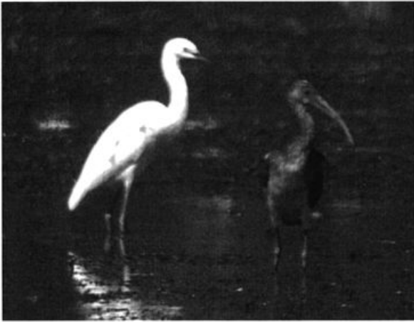
This juvenile White Ibis (right) was present at Lake No. 9, Fulton County, Kentucky 28 July 2007 and again 10 August (here).