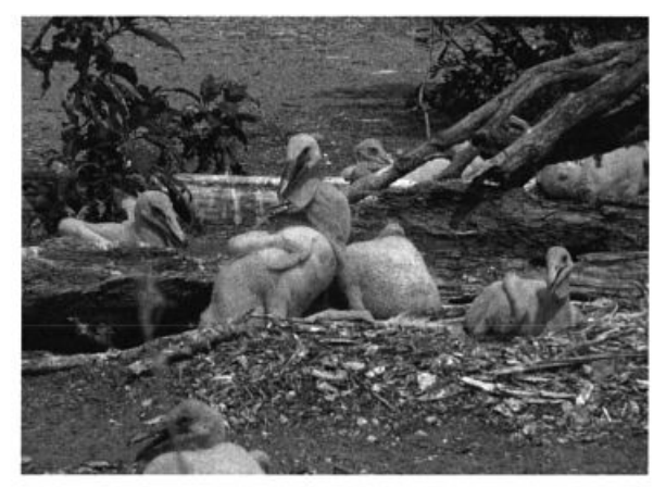
These young American White Pelicans in colony on a spoil island in Clinton County, Iowa 13 June 2007 mark the first successful nesting by the species in the state.