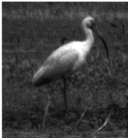
A one-day wonder, this adult White Ibis, Indiana's third adult ever, was photographed at Pine Creek Gamebird Habitat Area in Benton County on 1 July 2007.

A brood of Ruffed Grouse was seen sw. of Bloomington 23 Jun (VW). Late Common Loons were seen on L. Monroe 12 & 22 Jun (DRW), at Goose Lake Prairie S.P. 10 Jun (UWG, REF, m.ob.), and in Jasper, IL 4 Jun (CLH). A Common Loon in alternate plumage was present 18 Jul–4 Aug at the Jake Wolf Fish