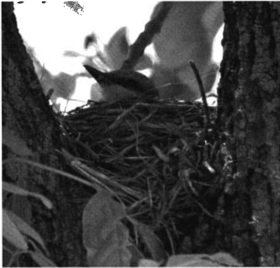
While sight records of Western Kingbirds are not exceedingly rare in the Illinois & Indiana region, nesting records are very much so. A pair was present at a nest in Pulaski County, Indiana from 9 (here) through 19 June 2007; the nest was not successful.

(D&HW). A Virginia Rail calling 14 Jun (JC, BF, RRu, LWS), and another seen 3 Jul (LWS), at Goose Pond represented fairly southerly breeders or non-breeding summering birds. Single Soras at Goose Pond 18 (LWS, SE) & 28 Jul (LWS) could have been non-breeders or early fall migrants. Common Moorhens were reported from seven different counties in Indiana, with successful reproduction occurring in at least three different locations. From Illinois, ad. Common Moorhens with young were observed at James Pate Phillip S.P. (PMx), at Rollins Savanna, Lake (MF), and at Horseshoe (DMK, KAM et al.), and moorhens were seen at eight additional Illinois locations, but with no young birds noted.