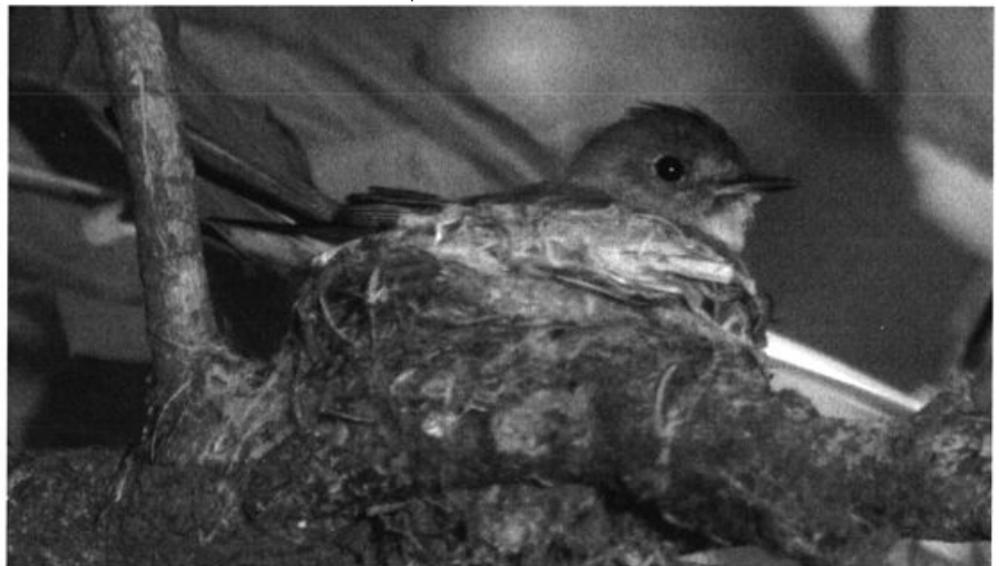
This Western Wood-Pewee was observed building a nest along the Des Moines River near Jackson, Jackson County, Minnesota in late June 2007 and attending at least one small chick 21 July (here). Its mate was presumed to be an Eastern Wood-Pewee, as one was calling near the nest on several occasions. A breeding record from Roseau County, Minnesota in 1977 may also have involved a mixed pairing between these two species (Loon 49: 169-170).

Michigan reported Yellow Rail in Keeweenaw in addition to the usual location at Seney N.W.R. Wisconsin had King Rails in Fond du Lac 6 Jul (DG) and Dodge 17 Jul (DT). In Michigan, King Rail was found at two locations about a mile apart at Pte. Mouillee 10 (SB) & 17 Jun (p.a., AMB, BMu, ST). Common Moorhens in six Minnesota