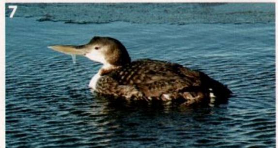
7 • Furnishing the seventh record for Montana, this Yellow-billed Loon was found 4 (here 5) January 2007 on the Missouri River in Great Falls and remained for several days.