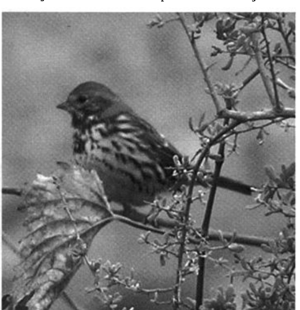
Three of the Fox Sparrow subspecies groups are believed to winter regularly in Baja California, primarily in the mountains. The fourth, Red Fox Sparrow, is casual. This Red Fox Sparrow, presumably of the taxon zaboria , was photographed in El Rosario 27 December 2006.

29 Dec, as was a single Vesper (fide MJB, EM). The season's only Red Fox Sparrow was in El Rosario 27 Dec (ph. JEP). Single Swamp Sparrows were on the Maneadero Plain 29 (†JEP) & 30 Dec (ph. MS, DWP). Single White-throated Sparrows were in Tijuana 16