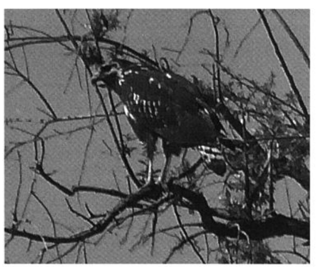
This immature Common Black-Hawk at Miraflores, Baja California Sur 26 March 2007 established the first confirmed Regional record.

Glaucous-winged Gulls were typical for the Mexicali Valley, but a Mew at the Mexicali Country Club (ph. KAR) and a first-winter Western at a landfill w. of Colonia Pacifico (†KAR et al.), both 29 Dec. were the 2nd and first in the valley, respectively. Overdue for Baja California, and coinciding with unprecedented numbers to the n. at the Salton Sea. were records of 4-5 Lesser Black-backed Gulls: a third-winter and a first-winter bird were together at the Río Colorado delta 20 Dec (†RAE, ph. †MJB); an ad. at the landfill was well photographed, but a first-winter bird there was not documented 6 Jan (ph. KAR, RJ, DP); and an ad. at Laguna Guerrero Negro 25 Jan was just n. of the state line (ph. RC, AC).