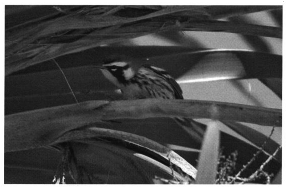
This albilora Yellow-throated Warbler, photographed on 30 December 2006, was among the highlights of the previous day's Ensenada Christmas Bird Count.

(ph. MJI, ph. REW et al.); a male Black-throated Blue in Guerrero Negro 15 Nov-30 Mar (AG-A, ph. RC et al.) for its 3rd consecutive winter; 2 Black-throated Grays at the Mexicali Zoo 21 Dec (male; ph. MJB, RAE) and 25 Jan (female; RAE); a Hermit in Tijua-