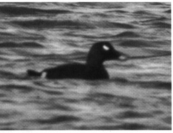
Barely reaching Baja California Sur, this adult male White-winged Scoter at Laguna Ojo de Liebre 15 December 2006 was the first confirmed in the state.

Sandhill Cranes were found again in the ne., with 3 at the Mesa Andrade wetlands 7 Dec (ph. ESM) representing only the 3rd modern record for the Region. Solitary Sand-