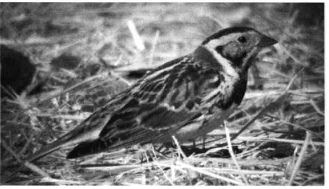
This male Lapland Longspur was discovered wintering in the Sonoita Grasslands near Elgin 12 Feburary 2007; inexplicably, there are fewer than fifteen documented records of the species from Arizona.

Tree Swallows on the Gila River C.B.C. 27 Dec (fide TC) was high for s. Arizona in winter. A Violet-green Swallow at Gilbert 14 Feb (DP) was likely an early spring migrant, as was a Cliff Swallow at the same location 10-14 Feb (PD). Scattered Barn Swallows were found at s. Arizona locations during Dec, while singles at Santa Cruz Flats 26 Jan (DJ) and at Sweetwater 28 Feb (DS) may have wintered locally. Of the more than 15 Winter Wrens found this winter statewide, 3 were identified by call (and plumage) as "Eastern" Winter Wrens. One was at Huachuca Canyon 3 Dec (RH), one along the S.P.R. s. of Hwy 90 7 Dec-13 Feb (SH), and one was at Tubac 7 Ian (WR). The status of "Eastern" Winter Wren in Arizona is still poorly understood, as identification requires detecting subtle call differences, as well as somewhat variable plumage characteristics.