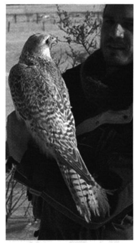
Seeing a Gyrfalcon anywhere in North America makes a birder's day. Birds in the white morph, such as this one banded at Saskatoon, Saskatchewan on 3 January 2007, are even more highly prized.

and at Regina, SK 27 Dec (B&SE). Varied Thrush numbers in s. Manitoba were unprecedented, with at least 11 birds reported in Winnipeg and many small towns; 4 were noted in Saskatchewan (m.ob.). A tardy Gray Catbird was at Winnipeg 4 Dec ( fide RP). The Curve-billed Thrasher previously reported at Dalmeny, SK was last seen mid-Dec (DFr, m.ob., ph.). Brown Thrashers were at Good Spirit Lake PP. 15 Dec (B&JA), Hodgeville 5 Feb ( fide BL), and Swift Current about 12 Feb