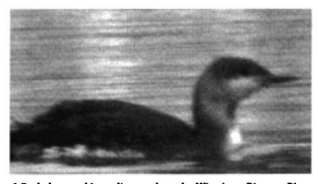
A Red-throated Loon lingered on the Winnipeg River at Pine Falls, Manitoba from 2 (here 11) December 2006 through at least 9 January 2007, furnishing the province's second winter record.