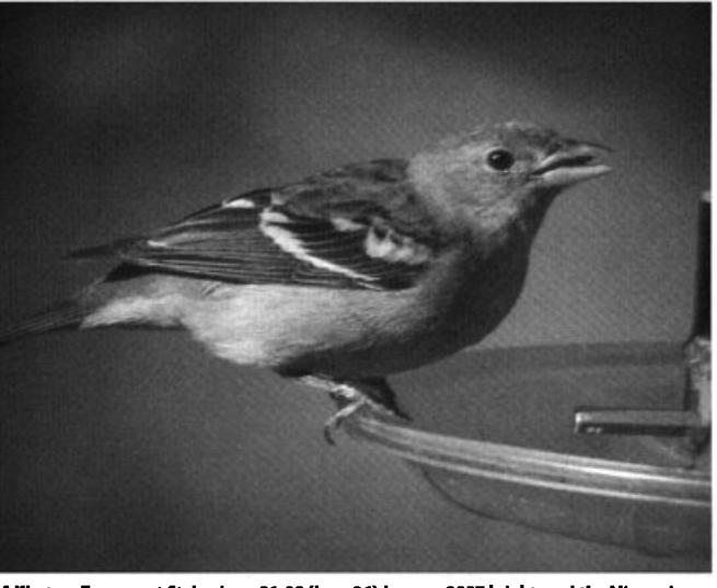
A Western Tanager at St. Louis on 21-28 (here 26) January 2007 brightened the Missouri winter.

with 7 Virginias and 2 Soras there 16 Dec (IE). There were 7 Sandhill Cranes on at S.C.N.W.R. 6 Dec (TR); unusual were mid-winter reports from n. Iowa, including one in Cherokee 2 Jan (DB), one in Floyd 13 Jan (JG, SJD), and 5 in O'Brien 2-23 Feb (fide DK, LS). Interesting shorebird reports from Missouri included 2 Least Sandpipers at Winfield Slough, Lincoln 10 Dec (JE), a Baird's Sandpiper at Big Lake S.P., Holt, MO 14 Dec (ph., †BJ, a 2nd state record in winter), and a Dunlin at Otter Slough C.A., Stoddard 21 Jan (JE). An ad. Franklin's Gull was reported at R.M.B.S. 27 Jan and 13 Feb (DaR), while Bonaparte's Gulls peaked at 365 at Stockton Res., MO (MR). In addition to the Franklin's Gull report, R.M.B.S. hosted the rest of Missouri's best gull reports, including at least 2 Thayer's Gulls (JU, BR), at least 4 Iceland Gulls (BR, JE, MT), at least 4 Lesser