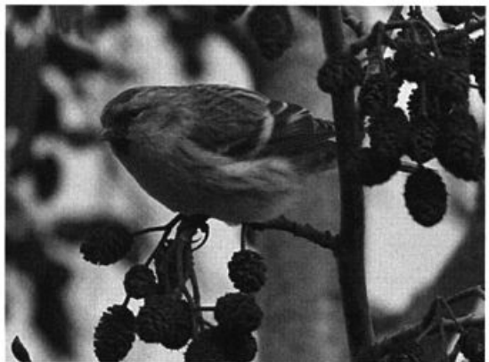
A notable rarity in lowa was this Hoary Redpoll 16 December 2006 through 26 (here 6) January 2007 at the Brenton Arboretum in Story County.