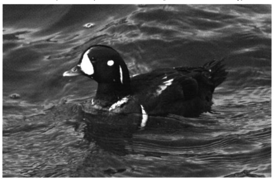
Two Harlequin Ducks spent the winter season (here 9 February 2007) through the season in Scott County, lowa.