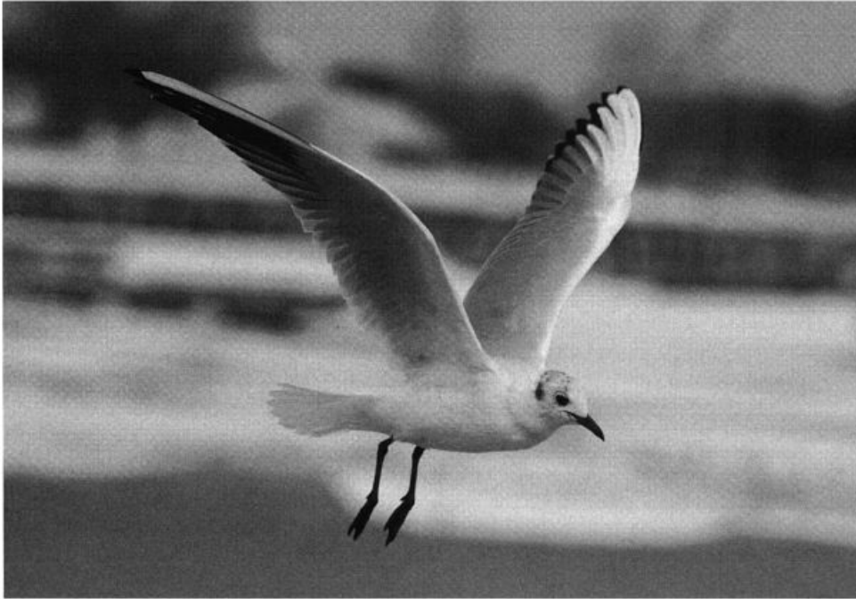
Discovered on 23 (here 28) February 2007 at Chicago's Montrose Harbor, this Black-headed Gull stayed well past the end of the season, allowing many people to see it.

Jasper, IL 16 Feb (RES, SAS). Wild Turkeys continue to do well in the Region: counts of 190 at Hawthorn 20 Dec (D&BW et al.) and 110 at Rend L. 16 Dec (DMK) were the highest of the season. Northern Bobwhites, however, remain scarce. A peak tally of 20 birds 30 Dec in Union, IL (VMK, KJM, BT, DFS) was one of only three double-digit tallies reported.