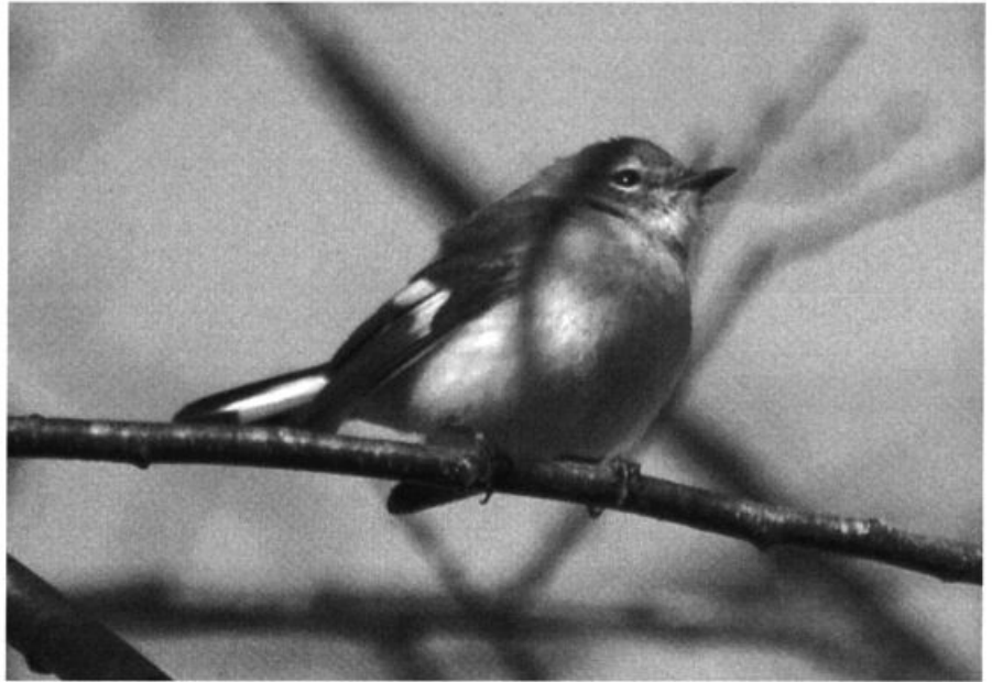
This American Redstart provided the first confirmed December record for Indiana at Beverly Shores in Porter County (here 2 December 2006).