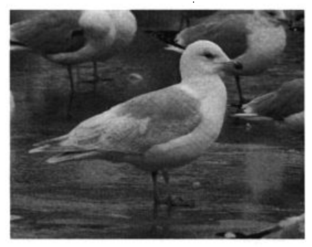
Part of an influx of gulls at Pittsburgh, Allegheny County, Pennsylvania 17 February 2007, this bird was one of two secondcycle Iceland Gulls detected.

Scoters 1 Jan, with 30 Surfs there 21 Jan (NA). Although common in early Dec, Black Scoters numbered no more than 3 into late Jan in Ohio and at P.I.S.P. 12-21 Jan (JM). Scoters were mostly on L. Erie until the freeze, when single Surf and Black Scoters appeared at Alum Creek Res., Delaware, OH 2 Feb (RTh). One remained at L. Arthur, Butler,