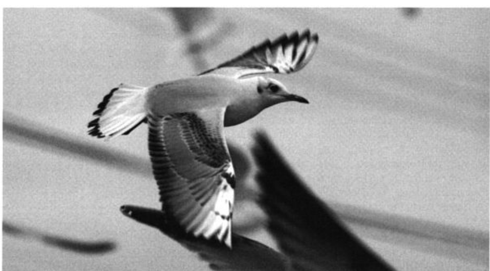
This first-cycle Black-headed Gull was photographed at Tullytown, Bucks County, Pennsylvania 12 January 2007; the species is recorded almost annually in the state.

The 119 Gadwalls on Kelleys I., Erie 20 Jan