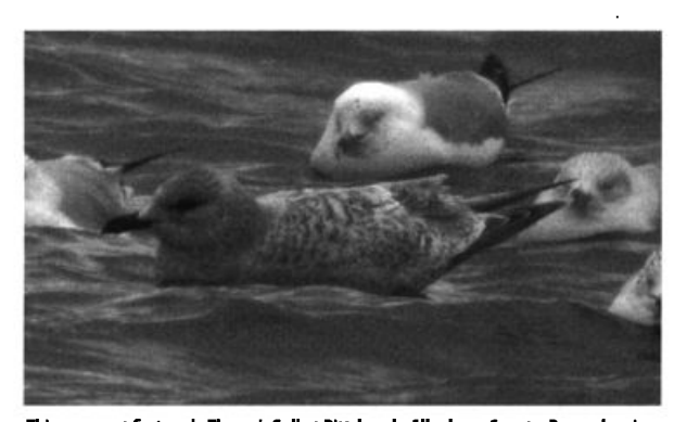
This apparent first-cycle Thayer's Gull at Pittsburgh, Allegheny County, Pennsylvania 18 February 2007 was part of a gull invasion there; its Identification stimulated much discussion, as the petite head/bill and lightly marked tertials suggest Kumlien's Iceland Gulls.