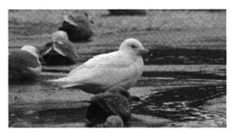
White-winged gulls, which often move southward in winter as large lakes in Canada begin to freeze, turned up in states south of the Great Lakes mostly in February 2007, as the season turned from unseasonably warm to bitterly cold. This first-cycle Glaucous Gull was photographed at Pittsburgh, Allegheny County, Pennsylvania 10 February 2007.