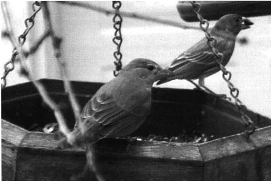
This Summer Tanager frequented a feeder in Gloucester, Carteret County, North Carolina from mid-January (here 21 January) 2007 until the spring season.