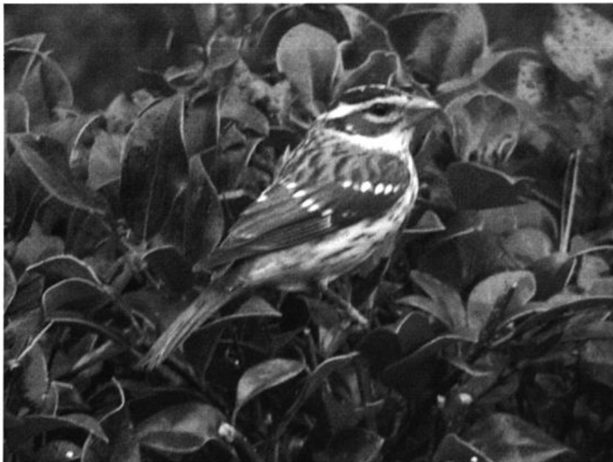
This Rose-breasted Grosbeak was in a Manteo, North Carolina yard from 14 (here 23) December 2006 into January 2007. Lingering and wintering grosbeaks have become almost an annual occurrence in the Southern Atlantic Region.