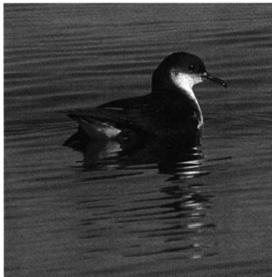
This Manx Shearwater, one of three found off of Tybee Island, Georgia 14 January 2007, provided rare documentation for that state, although records from adjacent areas of ocean would seem to indicate the species is a regular migrant and perhaps irregular winterer here.

American White Pelicans continued to increase in much of the Region. The top totals reported included 697 on the ACE Basin, SC C.B.C. 31 Dec (fide PL) and 467 on the McClellanville, SC C.B.C. 17 Dec (fide ND). The 110 counted on the Bodie-Pea Island, NC C.B.C. 28 Dec (fide PS) was very noteworthy that far north. Impressive for a non-coastal location, 160 were at Bagby S.P., L. Walter F. George, GA 2 Dec (JFI, EH). With numbers like these, and the fact that the species is present along the s. coastal regions practically year-round, can nesting be a possibility in the near future for our Region? Anhingas also continue to winter in increasing numbers. The farthest n. and inland were the 2 at a pond in Halifax, NC 24 Dec-27 Jan (ML, FE). Unusual reports of long-legged waders included a Least Bittern at L. Warren, Hampton, SC 12 Feb (JG), a white-morph Reddish Egret at Ft. Fisher, NC 31 Dec (RD), and a Green Heron far inland on the Greensboro, NC C.B.C. 16 Dec