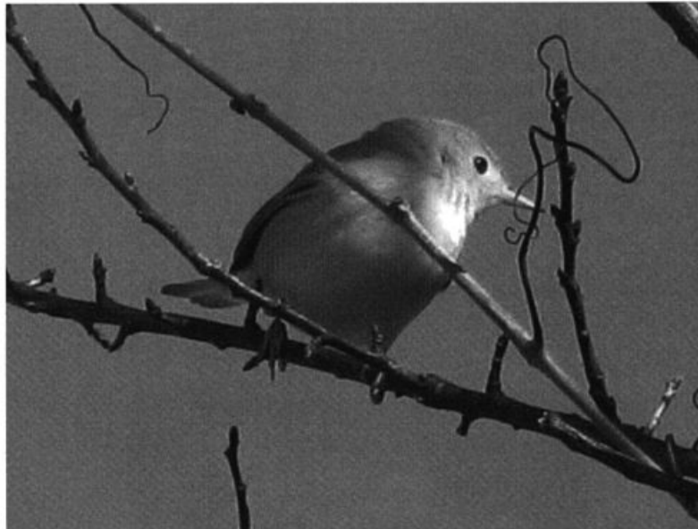
This Yellow Warbler was one of five different individuals found on the causeway at Lake Mattamuskeet, North Carolina during the Christmas Bird Count there 29 December 2006. This species has been known to winter at that site but not in such numbers.

NC C.B.C. 28 Dec ( fide LW), and 5 were on the L. Matt. C.B.C. 29 Dec (JL). Several of the latter birds were still present as late as 14 Jan (SS). A Cape May Warbler was a good find on the Duke University campus, Durham, NC 9–10 Feb (TG, CRF et al.), as was a Black-throated Blue Warbler at the same spot 10 Feb (CRF et al.). Another Black-throated Blue was a surprise at Table Rock S.P., SC 6 Jan (PSe), providing a most unusual mt. sighting for the