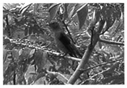
Although reported almost annually now, Scarlet Tanagers had not been photographically documented in El Salvador until this male, the country's fifth record, was found 14 October 2006 at San Ignacio, Chalatenango Deparment.

2004, it was likely overlooked, as it is relatively quiet in winter and typically perches low in tall grasses, where it can be missed by those unfamiliar with its distinctive call. The