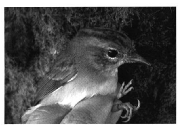
An immature Golden-crowned Warbler captured 29 August 2006 at a coffee plantation in Izalco, El Salvador was 20 kilometers from the nearest known breeding population. Although likely a disperser from a local population, migration in the species is also a possibility.

country. On 15 Nov, the monitoring station at the Santa Ana Volcano in Santa Ana, El Salvador captured a female Amethyst-throated Hummingbird (ph. VG), the first record for Los Volcanes N.P., and an apparent vagrant some 50 km from the nearest known population. Rarely reported in Guatemala's Sierra Sacranix, a male Sparkling-tailed Hummingbird was found at 1500 m in Sanimtacá, Alta Verapaz 22 Aug (EPC).