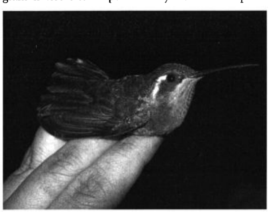
Ornithologists have intensively surveyed and monitored the cloud forests of the Santa Ana volcano complex in El Salvador since the 1920s, without ever recording an Amethyst-throated Hummingbird. This female captured at a permanent monitoring station 15 November 2006 was apparently a vagrant or disperser, perhaps from Montecristo cloud forest 50 kilometers to the north. One month later, the monitoring station captured two additional males, so perhaps we are witnessing a colonization event.

on the Azuero Pen. Also at Cobachon on 5 Aug (MD) were 5 Painted Parakeets. This species is rarely reported in its restricted range in Panama. A Black-billed Cuckoo was photographed at 2000-m Dota, Cerro de la Muerte 5 Oct (PM). This relatively rare migrant is not often reported away from the