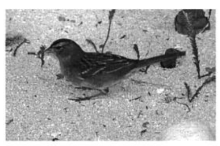
Following on the heels of Central America's first Whitethroated Sparrow on Belize's Half Moon Caye in May 2005 was this White-crowned Sparrow, Belize's second, found in virtually the same spot on 5 November 2006.

A Common Yellowthroat on Caye Caulker 28 Aug and a Summer Tanager there 1 Sep (J&rDB) were early migrants; conversely, a male Scarlet Tanager in Punta Gorda 23 Nov (LJ) was the latest fall migrant on record for Belize. An imm. Golden-crowned Warbler banded 29 Aug in a coffee plantation in Izal-co (VG, ph. RJ) was either a rare migrant or a disperser. The nearest known breeding population is at Apaneca, about 20 km to the west. A male Scarlet Tanager at San Ignacio 14 Oct