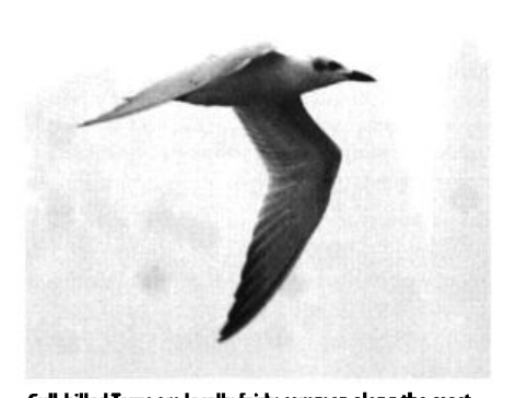
Gull-billed Terns are locally fairly common along the coast of Belize, principally at shrimp farms and a few kilometers inland at Crooked Tree Wildlife Sanctuary, but this one at the Blue Creek rice fields, Orange Walk District 5-9 (here 6) September 2006 (with 2 there on the 9th) provided the only truly inland record for the country.

but no photographs were previously obtained. Three King Vultures were seen from the TELCOR tower site at 600 m on the La Virgen/San Juan del Sur road in Rivas 30 Nov (JM), and single individuals had been reported in the area in the preceding four weeks (LL, PS). This species is local and rare in Nicaragua, and existing populations are not