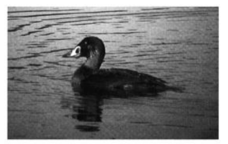
An immature male Surf Scoter was discovered on Mangrove Lake, Bermuda 27 November 2006 (here 22 December) and remained into the New Year, furnishing the ninth record for Bermuda.