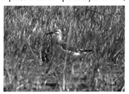
Two Wilson's Phalaropes were found in the Blue Creek rice fields, Orange Walk District, Belize 3 September 2006, adding to three previous records for the country, one in fall and two in spring.