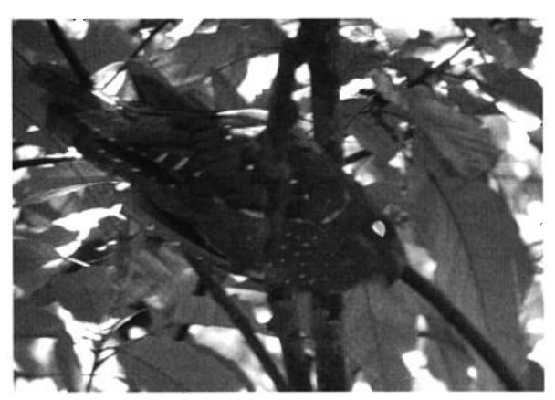
Providing the third documented and first lowland record for Costa Rica (and the first to be found alive) was this Oilbird found in Sector Madrigal, Corcovado National Park, Puntarenas on 3 October 2006. Previous records were of a desiccated corpse found under a powerline on Cerro de La Muerte and a road-killed bird found at Monteverde.

department and the first documented by photograph in El Salvador. The Southern Lapwing first seen at C.T.W.S., Belize in Mar 2004 was still present through the end of the period (m.ob.). Two American Oystercatchers seen on several occasions on a beach s. of Monkey R. 13 Nov+ (MM) may have been the first recorded in Toledo. This species is a rare and local winter visitor in Belize, with most records coming from the mouth of Stann Cr. in Dangriga. Also rarely seen in Belize was an American Avocet at Fresh Catch Fish Farm near La Democracia 20 Nov (PB, MB, MyB). An Upland Sandpiper observed near the border of R.B.C.M.A. and Blue Creek, Orange Walk 13 Oct (RP, CH, VR) provided the latest fall date yet for this infrequently encountered transient in Belize.