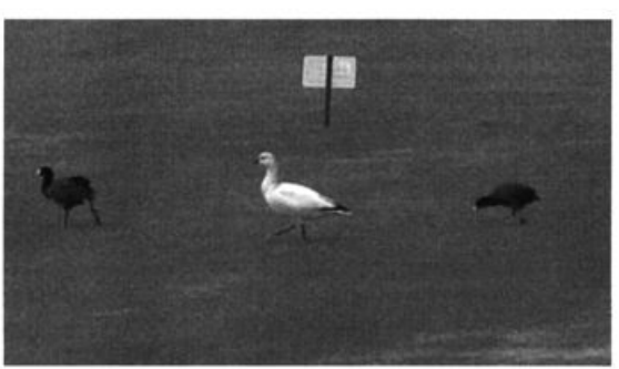
A Ross's Goose at Reef Golf Course, Grand Bahama Island, Bahamas 18 November 2006 (here) provided a first record of the species for the country and for the West Indies.

Nov (10 hours) from Petite-Terre N.R., Guadeloupe produced 11 Cory's Shearwaters, a Black-capped Petrel, and 2 unidentified Pterodroma. A late White-tailed Tropicbird was over Darrell's I., Bermuda 22 Oct (AD, PW). Three Masked Boobies were seen off the East End, Bermuda 14 Sep (PW), probably the result of Hurricane Florence, which skirted the island 10 Sep; another was seen 17 Oct, also off the East End, Bermuda (PW). Single Brown Pelicans in the Bahamas at Warderick Wells, Exumas 4 Aug (LD), Clifton Cay, New Providence 10 Sep (MD), and Montague Foreshore, New Providence 20 Sep (LG) were unusual. On Barbados, a juv. Brown Pelican took up residence in Bridgetown by the Main Bus Terminal 23-30 Sep (MF, EM). Grand Bahama's first 2 Neotropic Cormorants found at Reef G.C. 26 Sep were last seen 18 Nov (BH, EB, BP, PB). An Anhinga nest with 2 ads. and 3 young on Paradise I. 10 Sep (ph. PD) established the first nesting record of the species for the Bahamas; 3 female/young were seen there 17 Nov (CW, CI).