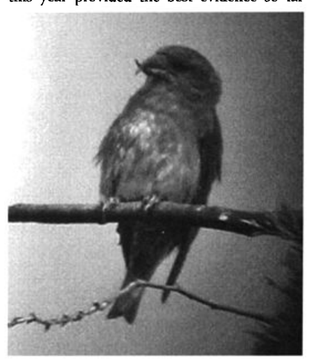
Apparently resident in the northern mountains of El Salvador, this Red Crossbill photographed 15 October 2006 at San Ignacio, in Santa Ana department, nonetheless represents just the sixth record for the country.

Individual Blue Seedeaters were banded 1 Aug (a juv.), 4 Oct, and 8 Nov at the monitoring station in El Imposible N.P. (ph. LA). Of the 10 seedeaters captured at the station since its inauguration in Nov 2003, 5 were in 2005 and 5 in 2006, all after a massive bamboo seeding event in Nov 2004 in the hills above the station. The juv. captured 1 Aug this year provided the best evidence so far