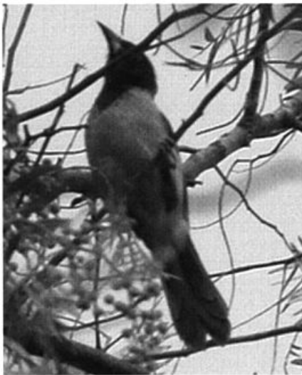
This photograph of an adult Audubon's Oriole in Bosque de Tlalpan 16 August 2006 is the first from the Distrito Federal. It has been uncertain whether the few records from Distrito Federal pertained to escapees, but because all records have come from this park near the edge of Mexico City (and span 1973-2006), natural provenance would seem far more likely.

The creditor and issuer of the American Birding Association VISA Platinum Card is U.S. Bank National Association ND.