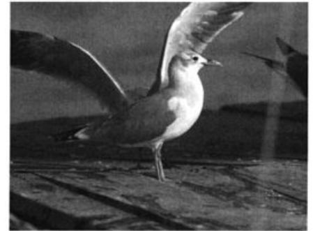
This aberrant Laughing Gull, discovered last year in Río Lagartos by Diego Núñez, has remained in the area (here 1 October 2006). The gape and base of the bill have now become black.

A Belted Kingfisher was in Tláhuac 31 Aug (RW, AMH, HGdS). American Pygmy-Kingfisher at El Mirador 2 Oct was above normal elevation (JM). A Great Kiskadee was on the UAM campus in Cuernavaca 6-8 Sep (AMH). A Bell's Vireo showed up at UNAM botanical garden, D.F. 22 Sep (ph. GdO). Two Rufous-naped Wrens were at Las Barrancas 5 Oct (M&BP, RE, RH), and at least 15 Sedge Wrens were near El Lencero 30 Aug (FGG, HGdS). A Gray-checked Thrush was behind Hotel Mocambo, Boca del Río 6 Oct (M&BP, RE, RH). An Aztec Thrush was at Las Minas, Ver. 7 Oct (CoW). Single Philadelphia and Red-eyed Vireos were at the Los Tuxtles biological re-