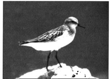
Recorded on Cozumel Island, Quintana Roo only once before, this Semipalmated Sandpiper was photographed near Punta Celarain 24 September 2006.