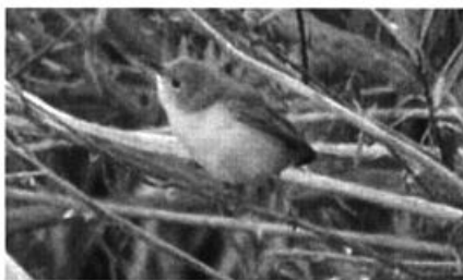
This Prothonotary Warbler showed up 21 April 2006 at Ciénega de Juana Ruiz, near San Miguel de Allende, Guanajuato.

rant (red-billed and red-legged) Laughing Gull was still at Río Lagartos in early Oct; it now has a black gape and bill base (DN, HGdS, vt. JdH, ph. LT). A Herring Gull was in Celestún as early as 2 Aug (AD), and a Common Tern, predominantly a transient on the peninsula, was at a tern roost near Las Coloradas 1 Oct (HGdS, JdH, IN). Three Blue Ground-Doves each were at Yoactún 27 Nov and at Chunhuas the next day (HGdS, MPV), while a White-crowned Pigeon was banded at Akumal 22-27 Sep (AR, WS). Three Eurasian Collared-Doves were in Tulum 25 Sep (HGdS, JdH), and one was at a Pemex station near Mérida airport 26 Nov (BD, LD, WD, CZ). Guatemalan Screech-Owl was abundant and very vocal along the Vigía Chico rd. 26 & 27 Sep, but on the same dates, only one Yucatan Poorwill was heard, and Yucatan Nighthawk was silent (HGdS, JdH, LT). An abandoned Lesser Swallow-tailed Swift nest at the Ejido Reforma Agraria, Q. Roo water tower 25 Nov (HGdS, MPV ph.) represented one of very few records from the Peninsula, previ-