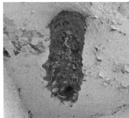
A Lesser Swallow-tailed Swift nest was found 25 November 2006 at Ejido Reforma Agraria, Quintana Roo, one of only three records of this species from the Mexican portion of the Yucatan Peninsula.

This autumn saw the subregion's first report of a Scaly-breasted Hummingbird, a species from Central America; it was in an area currently disputed between the states of Campeche and Quintana Roo. In addition, a Spotted Rail was new for the Campeche state list, and an additional record of Lesser Swallow-tailed Swift came from southern Quintana Roo. Interesting migratory bird data came from a research project being carried out in five locations along the east coast of the Peninsula, mostly in the Sian Ka'an Biosphere Reserve.