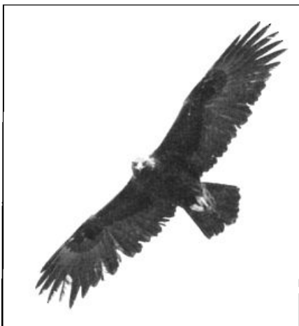
Two Golden Eagles were found 10 kilometers into Oaxaca state along the Puebla/Oaxaca highway 15 November 2006; the species is quite rare so far south in Mexico.

Three Muscovy Ducks were seen near San Blas (w. of the Sewage Pond Trail), and 5 more were just n. of Singayta 24 Nov (DS). Three white-morph and one imm. dark-morph Snow Geese and a female Hooded Merganser were in the golf course ponds at Puerto Peñasco, Son. 17 Nov (KC, MC et al.). A juv. Brown Pelican was found dead at km 99 of the hwy. between Sonoyta and San Luis Río Colorado, Son. 27 Jul (GR). An imm. Little Blue Heron was recorded in Cañón de Fer-