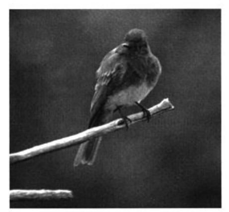
Colorado Black Phoebes are expanding their ranges in time as well as space, demonstrated by this bird returning for another fall (and second subsequent winter) below Pueblo Reservoir, Pueblo County, Colorado (here 16 August 2006).