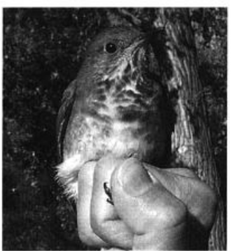
As Colorado has only one previous accepted fall record of the species, this Gray-cheeked Thrush banded at Barr Lake State Park, Adams County, Colorado 11 October 2006 was unexpected there.