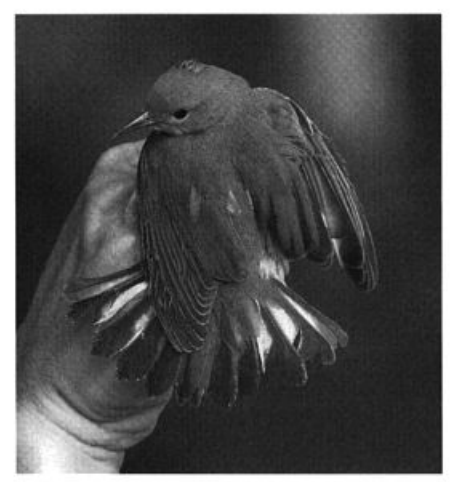
Prothonotary Warbler is much more common in spring in Colorado than in fall, so this individual banded at Barr Lake State Park, Adams County, Colorado 24 October 2006 provided rare, and very late, record.