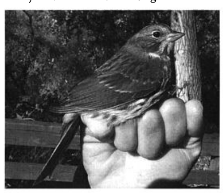
Red Fox Sparrows are annual but rare visitors to Colorado in late fall and winter, and this individual, banded at Barr Lake State Park, Adams County, Colorado 13 October 2006, appeared within the typical window of passage for this species. It represents a fourth county record, all of birds banded at this site.

An ad. male Black-and-white Warbler was on Colorado's West Slope, where the species is not annual, at L. Catamount, Routt 4 Sep (A. Hilf). An imm. female Prothonotary Warbler banded at Barr 24 Oct (†SN, ph. TL) was nearly record late. Worm-eating Warblers are