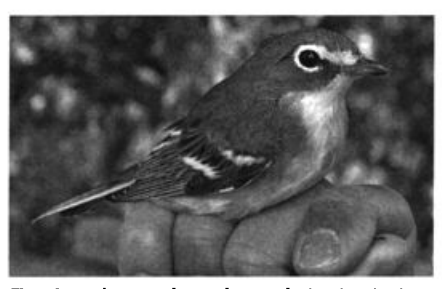
Though now known to be rare but regular in migration in Colorado, this Blue-headed Vireo banded at Barr Lake State Park, Adams County, Colorado 6 September 2006 provided one of relatively few well-documented occurrences and was only the second to be captured in the twenty years of fall banding at this site.