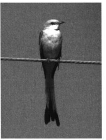
Colorado's only reported Scissor-tailed Flycatcher of the autumn 2006 season gave county listers a double-dip by perching along the road that forms the border between Pueblo County and Otero County 19-29 (here 24) September.