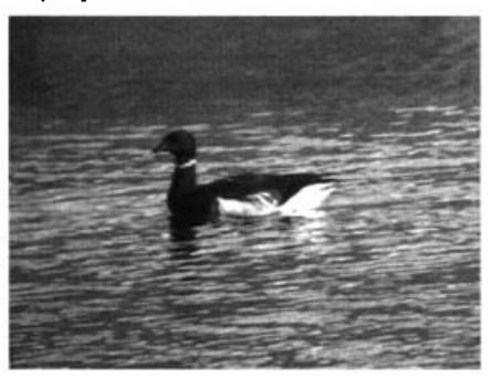
Brant finally made it onto the extensive Pueblo County, Colorado list in fall 2006: this adult nigricans spent a few weeks in the sanctuary of a fenced swimming pond below Pueblo Reservoir 7 (here) through 25 November 2006.

the-Region ad. male (consorting with a female) at Cherry Creek 22 Nov-7 Dec (S. Kennedy; ph. GW). A Gizzard Shad (Dorosoma cepedianum) population explosion (and die-off?) at McIntosh Res., Boulder in late Nov attracted large numbers of fish-eaters, including 1300 Common Mergansers and 4800 Ring-billed Gulls 26 Nov (TF). The 305 Redbreasted Mergansers at Valmont 23 Nov (TF) may represent a new state maximum.